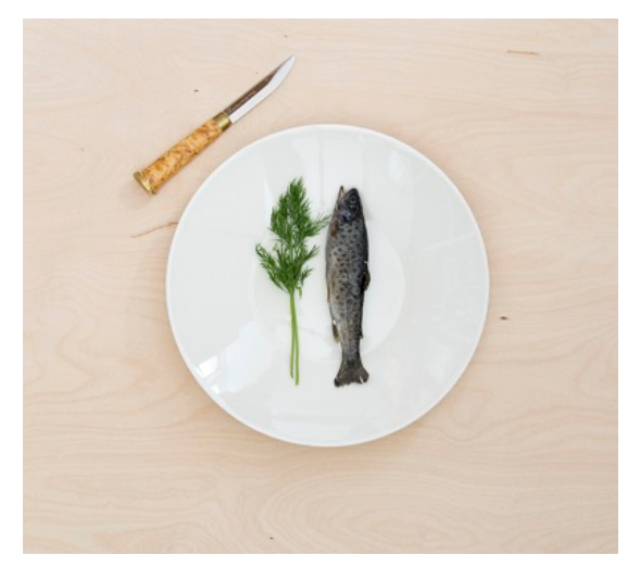
Figure 2: Arctic foods. A picture from NAM NAM exhibition on Arctic food culture at the Arctic Centre, University of Lapland.

For small rural communities, a prospective opening is finding niche in the production of high value foodstuffs from regionally available resources such as berries or reindeer. Such products have export potential, for instance to Asian markets.<sup>16</sup> Small companies play here a central role. Arctic branding of food products as clean, pure, and exotic may translate to higher prices and higher sales. Marketing of Arctic foods can benefit from lesser amount of pesticides used in colder climate. Specialized food production can be also combined with food tourism. Challenges include climate, demographics with many villages being currently partly abandoned, and distance from large markets (Olsen et al. 2016). Moreover, Arctic production of high value foods - as well as biobased chemicals or dietary supplements requires combination of traditional skills and occupations with high-tech bio-refining skills (see also, Regional Council of Lapland 2015; Troms Fylke 2013).