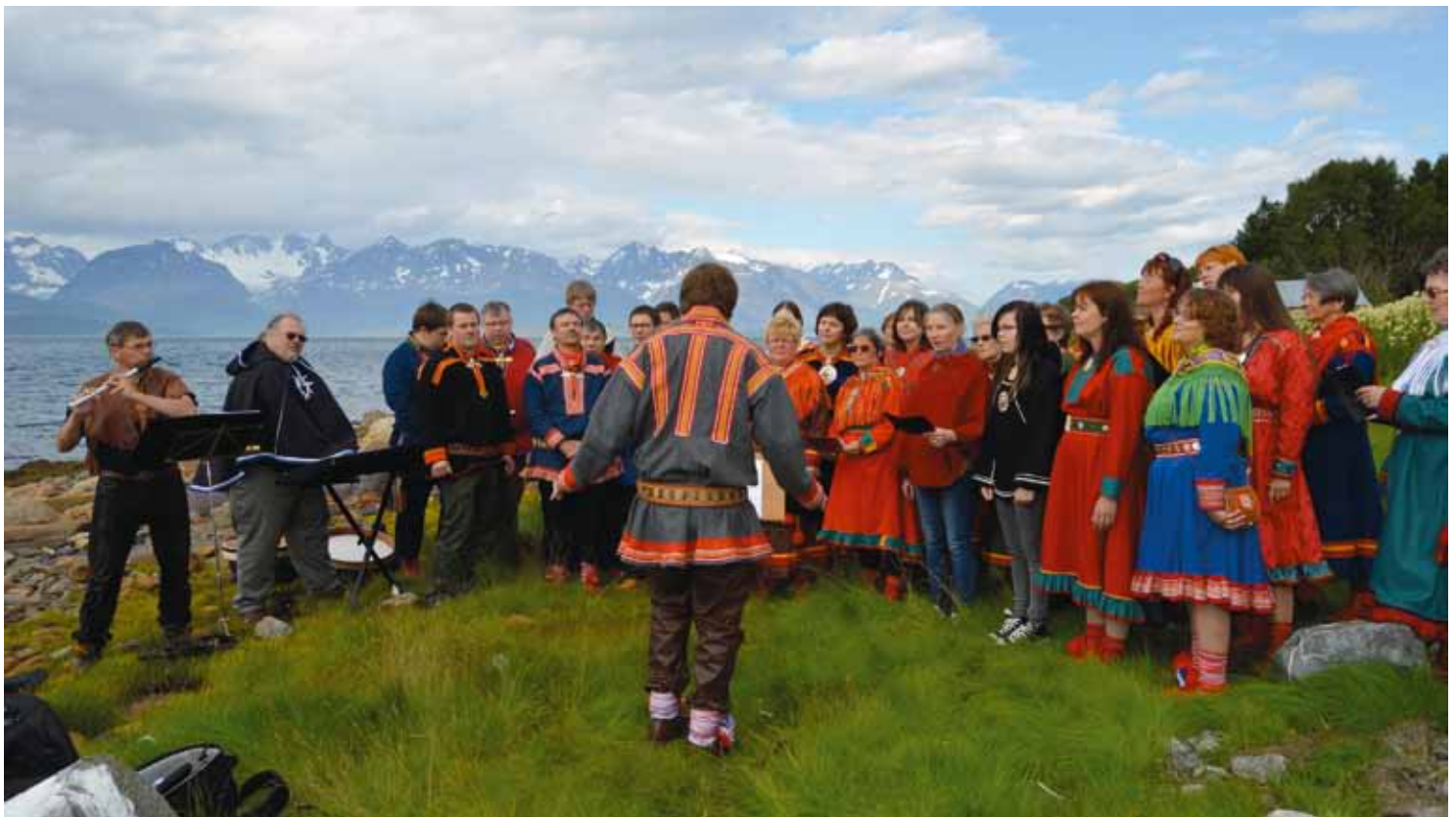
Kåfjord, Norway.

“It is dependent on research entrepreneurship, which can link up a series of geographically scattered research departments, universities and colleges through long-term project work – like the Arctic Human Development Report – rather than declarations of collaboration with their delegations of top-ranking academic leaders.” →