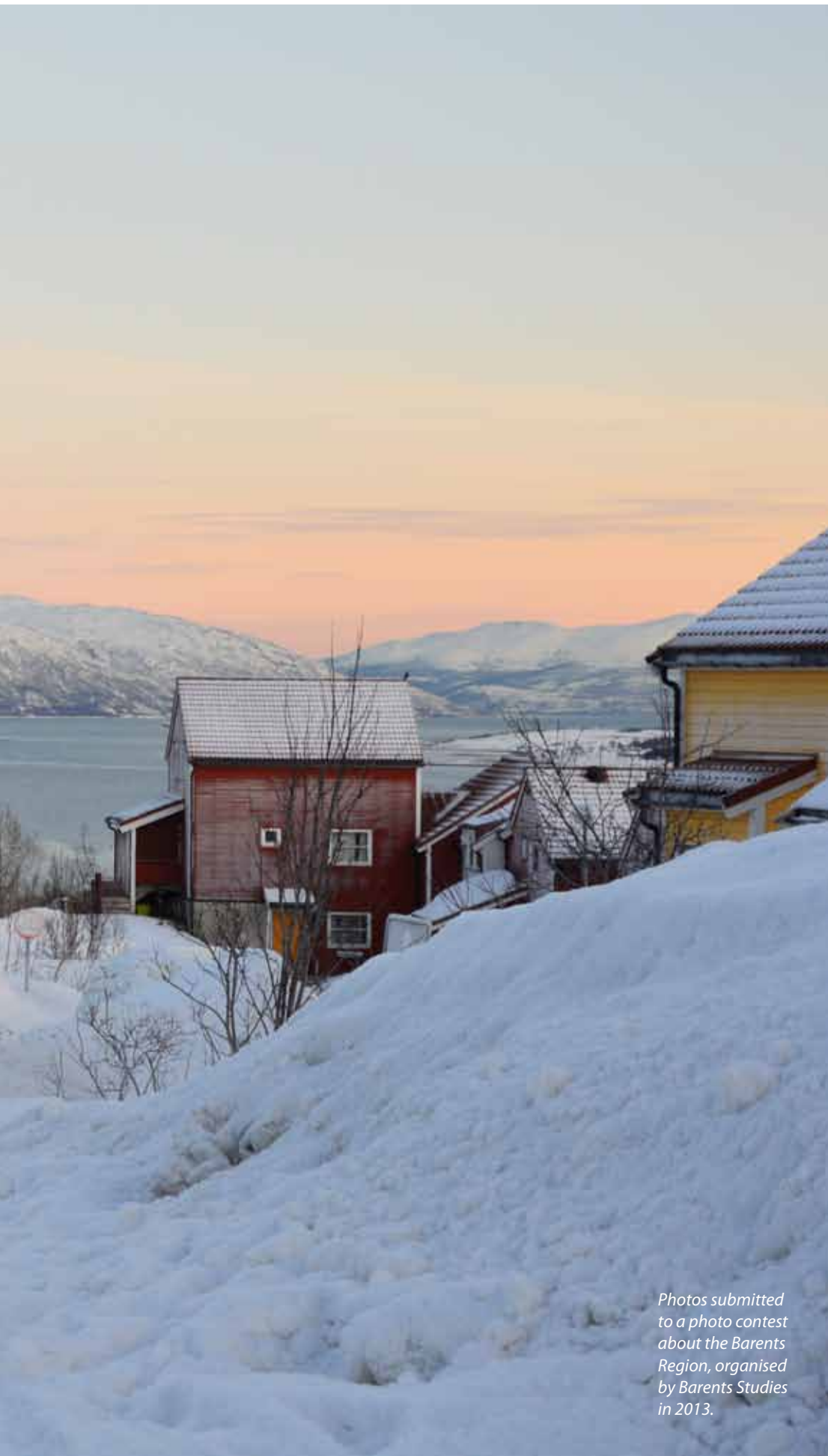
Photos submitted to a photo contest about the Barents Region, organised by Barents Studies in 2013.