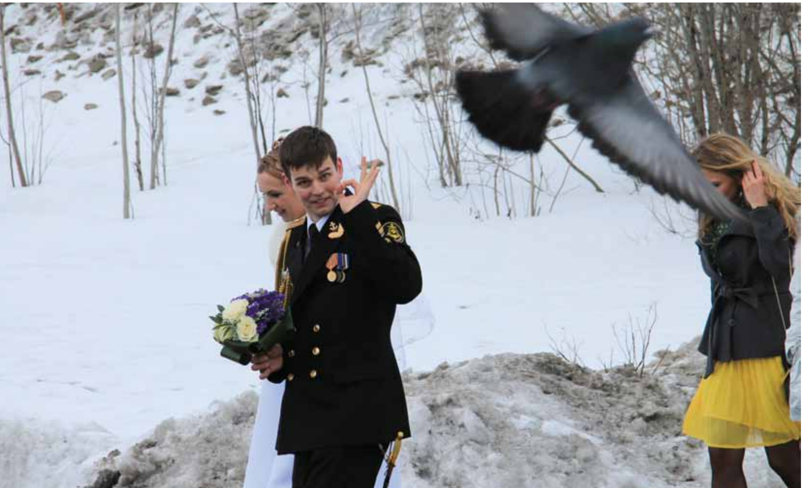
Murmansk, Russia.