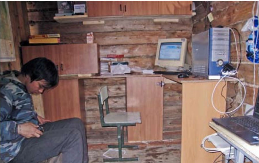
|20| Schoolboy in the classroom ↓

often considered to be less cultural and less advanced by the people living there. Reindeer herders' children feel marginalised by that dominant opinion, which is supported by the way culture, history and progress are presented in school books. The situation in the taiga is different. The value of indigenous knowledge is obvious there, while the superiority of school-book knowledge is not at all self-evident. This dependence on