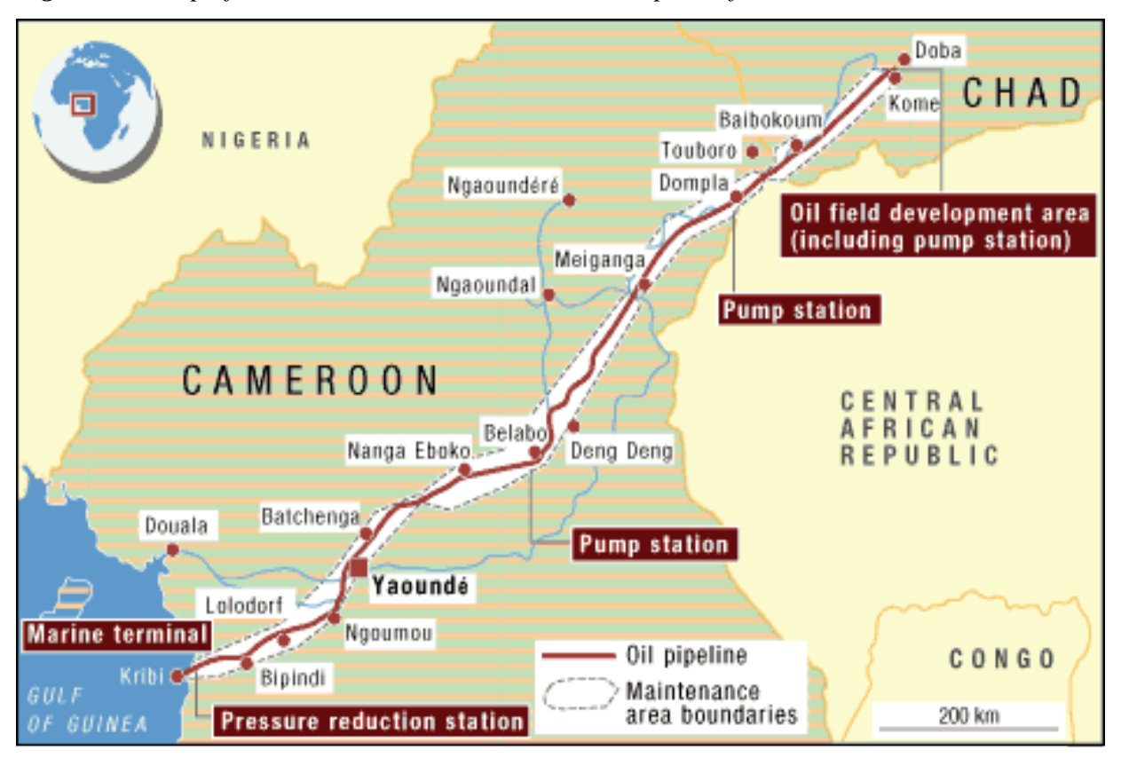
Figure 2-1 : map of the 1,070km Chad-Cameroon Oil Pipeline from Doba to Kribi<sup>20</sup>