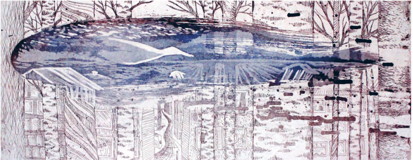
Serie of etching & aquatint prints, 5x 60cm x 50cm – 35cm x 42cm

The place you grow-up and the places you live in leave a trace, like a foot print to your identity. Creating the inner mindscape with layers of memories, times and places. The Northern landscape continues in the minds of the habitants of it's region. The rivers, the lakes, the springs – the water plays an active role in drawing the outlines. The mindscape we carry with us makes us sub-consciously to long for the open space, for the sense of the bark of the birch trees, for the cover of the forest.