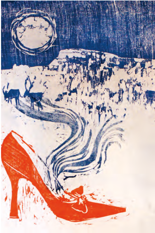
Woodcut 24 x 80 cm, 10 x 15 cm (several smaller ones as prints)