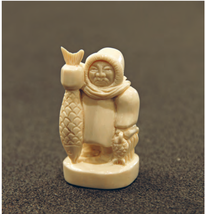
Mammoth ivory, three-dimensional fretwork 2013

Mammoth ivory carving is a traditional Yakutian art form. The carved statuettes have usually a warm and humorous perspective to Northernness and they capture rich mythology typical to the Arctic peoples everyday life.