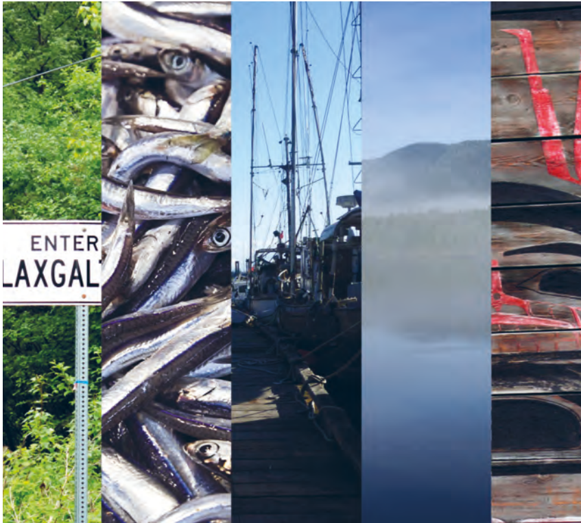
Video with sound (edited by Pascale Theoret-Groulx)

Oil and Water video/artwork highlights the complex conditions regarding overlapping and contested terrain where cultural heritage including historic and aboriginal trade routes, and the development of natural resource extraction industries including proposed crude oil pipelines, share the geography of remote northwest regions of Canada. The video poetically interweaves images and sounds of water and oil, fishing and refineries, rivers and tar sand pits that are intermeshed with sounds of people talking to suggest the need to reconsider a national identity based on the imaginary of empty wilderness. It emphasizes the dilemmas facing the nation with regards to petroculture and sustainability; to the risks and benefits to the environment, culture and the economy and a future imaginary.