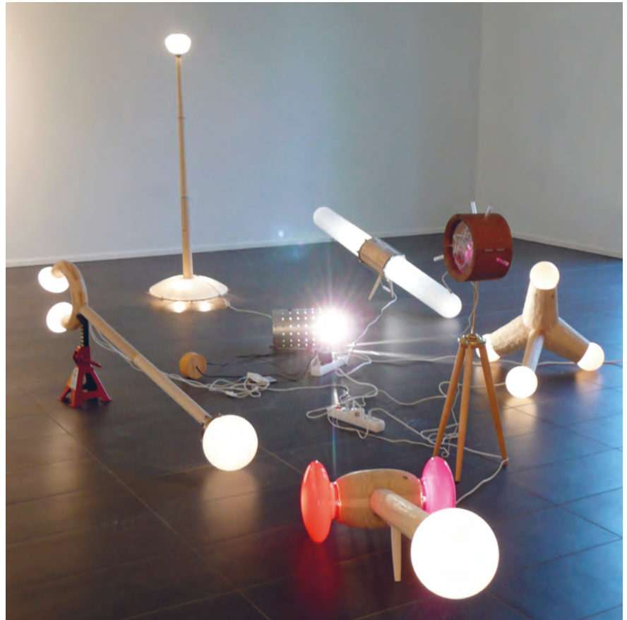
Wood, steel, ready-made, light, size variable. 2014

Lighten up our ways against the autumn darkness. Rise up on the light barricades because all is well.