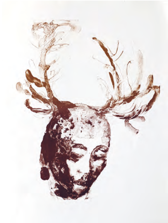
Lithograph: Roots 2013, 78x112cm