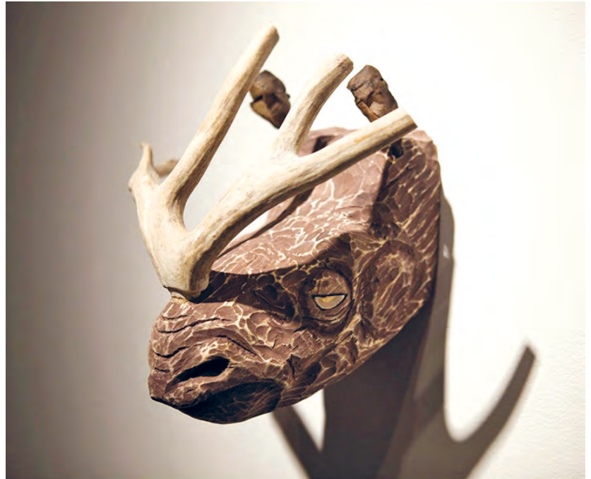
Serie of three wooden sculptures. 30x25x10– 40x20x35

These artworks consist of an identity exploration during a period of time spent in Alaska. It shows a way of connecting the alaskan environment, identity and tradition with my identity of a part nomad part northerner. The artworks show the perplexed feeling of human identity that can be found among us. Being a northerner and influenced by all other latitudes and longitudes. The sculptures are made with traditional alaskan carving tools such as adzes and crooked knives and influenced by alaskan native masks and native dance. I believe there exists a longing for the nature and animistic approach to world that's been found in the native arts.