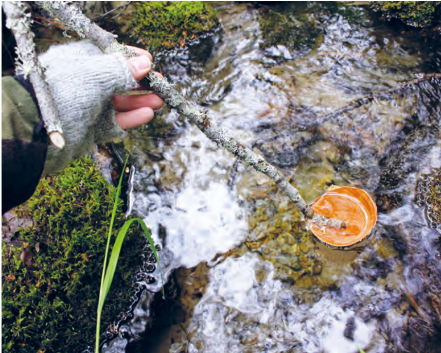
Installation 20x 200x200 cm