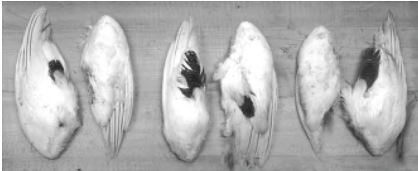
Clay, Wood, Audio 2014

Met kuljima riekon ansoila Eeron kansa lapsena kaiket talvet umpihangessa isot nutukhat ja sarkahousut jalassa.