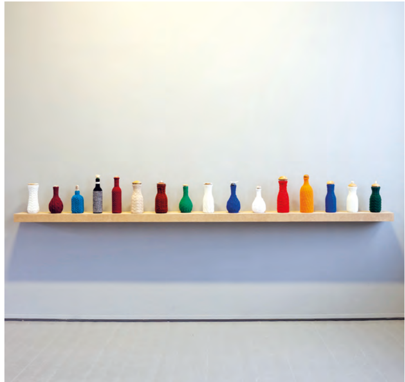
Carafes with knitted cover and reindeer horn lid

I have chosen knitting as a technique in my own work. I have combined knitting with prefabricated elements such as bottles that I have been given, found or purchased at jumble sales. These bottles are pre-defined, but I have wanted to give them a new identity, a transition from being a bottle to being something else.