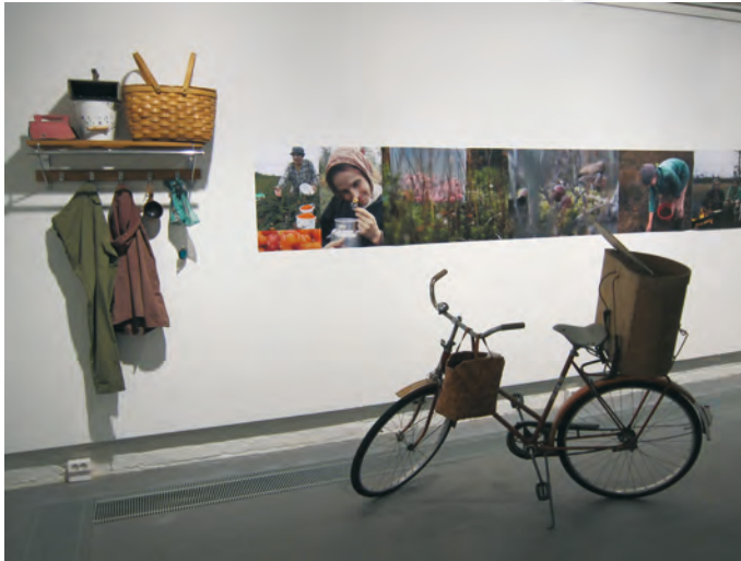
Installation, variable sizes 2011 University of Lapland, Finland www.ulapland.fi

There is a very long tradition of berry picking in Finland and Lapland. People live close to nature, surrounded by big forests growing blueberries and lingonberries and swamps growing cloudberrries and cranberries. Berry picking is 'every man's right', meaning that everybody can pick berries from every land. Nowadays most young adults pick fewer berries than some decades before, but berry picking is still an important part of the culture. For example, some schools have a lingonberry day at school, when pupils pick berries to be used in the school kitchen. Many people have a passion for cloudberrries in particular. The cloudberry is called the 'gold of Lapland', and the passion of picking cloudberrries is commonly referred as 'cloudberry fever'. I have categorized six types of pickers: nature aestheticians, health and fitness enthusiasts, household pickers, traditional grandmas, locals and social and sporadic pickers. In the Berry Pickers installation these six categories are represented by collages of items, clothes and photographs, with brief text describing each type of berry picker.