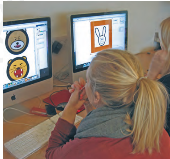
Computer Game 2012

The practice based result of the project, so far, includes an audio-visual "instrument" and a "computer game" created together with the children and students. The artistic results have been exhibited and evaluated by test groups at primary schools 2012. During the fall of 2012 an article will be written on the project, with focus on artistic pedagogy.