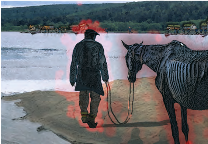
Digital Painting, 420 x 320 mm 2012 Kemi-Tornio University of Applied Sciences, Finland http://www.tokem.fi/In_English/Home.iw3