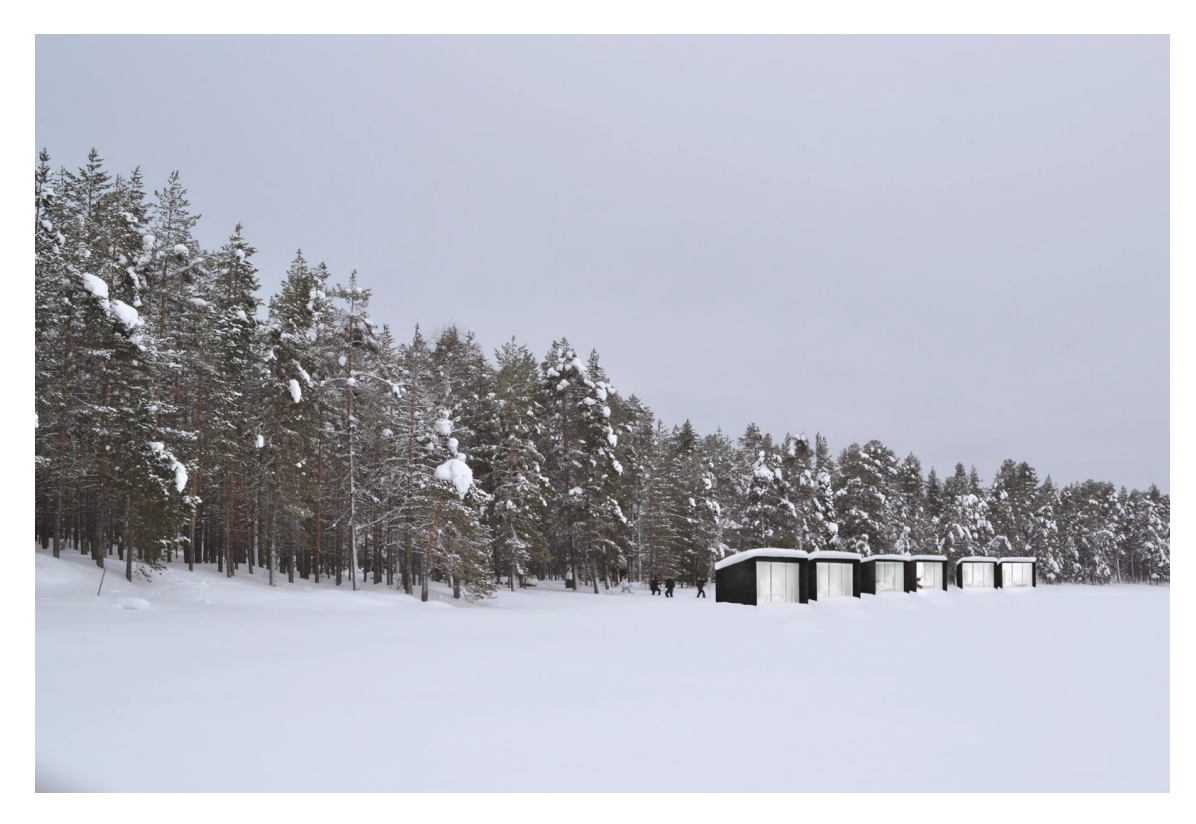
Fig. 4 - composite image of lakeside cabins by Jenna Holton

the final designs that I did not have to remake the image. This composite image is shown below: