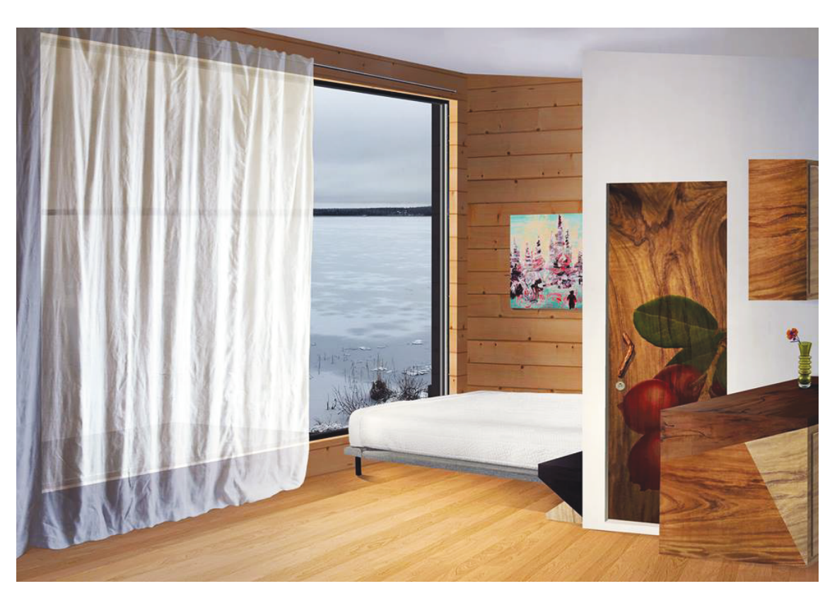
Fig. 8 - composite image of cabin interior by Jenna Holton