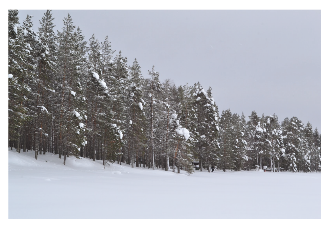
Fig. 3 - photo of the Pasmajärvi shore

During our trip to Pasmajärvi in March 2018, I took photographs of the landscape in order to have pictures for the composite images. An example is shown below: