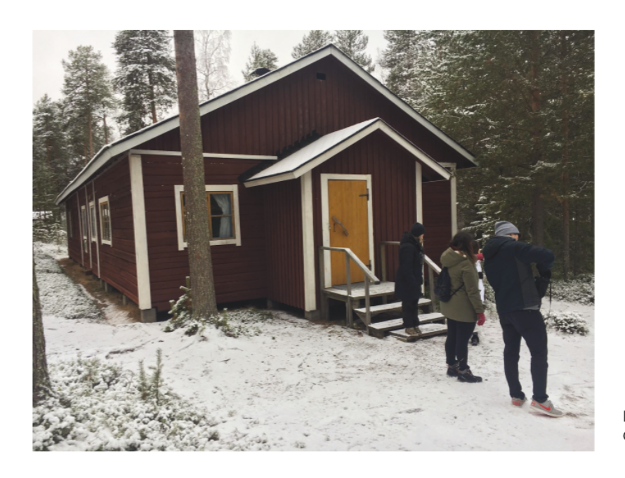
Focus on Finnish/Lapland culture and design