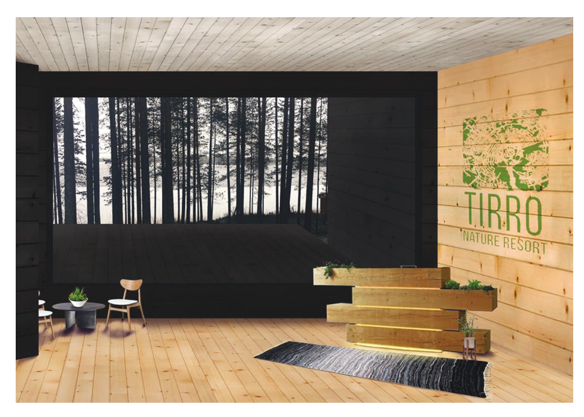
Fig. 5-composite image of planned hotel lobby by Jenna~Holton