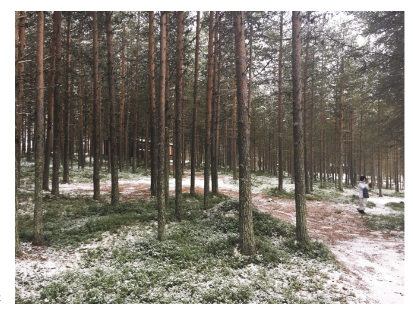
Low environmental impact