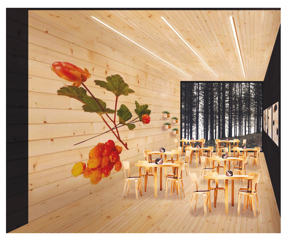
Fig. 7 - composite image of hotel restaurant by Jenna Holton