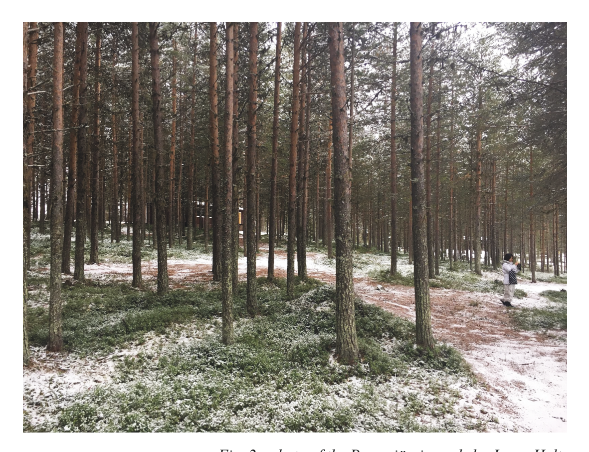
Fig. 2 - photo of the Pasmajärvi woods

One of my tasks for my individual project was to create a presentation for the architectural firm, which contained suggestions for focuses for design elements like designing to accentuate the natural environment, low environmental impact, focus on Finnish design, balance minimalism and functionalism with luxury, and foster simplicity and mindfulness. The presentation, which was shown in April 2018, featured photos of an example cabin by another Finnish architect and photos of the area I took in October 2017 when we first went to survey the area as seen below: