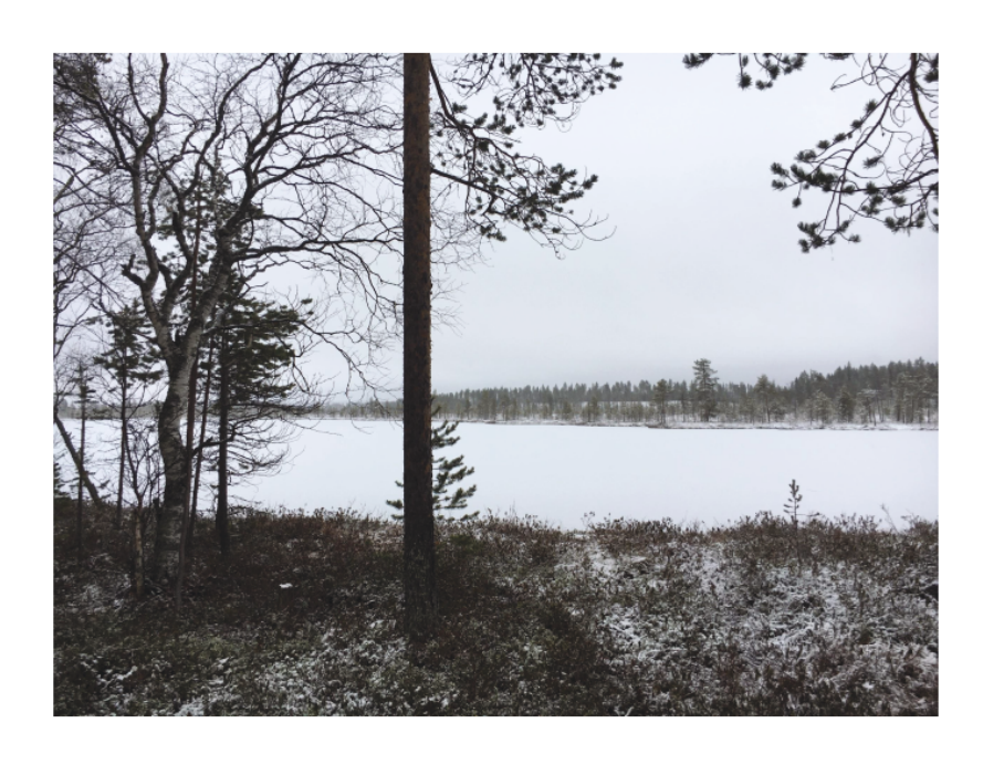
Accentuate the lake and natural views