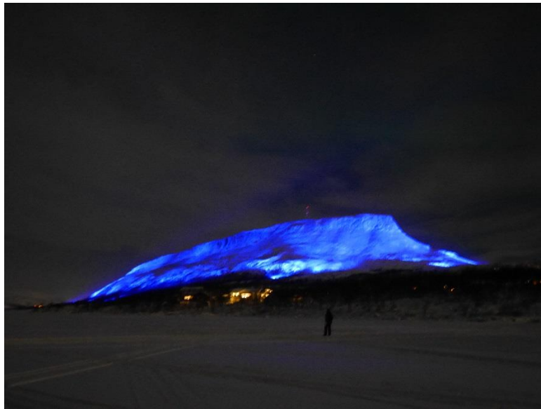
Fig. 3. The illumination of Saana mountain raised discussion of sustainable public art in Enontekiö.