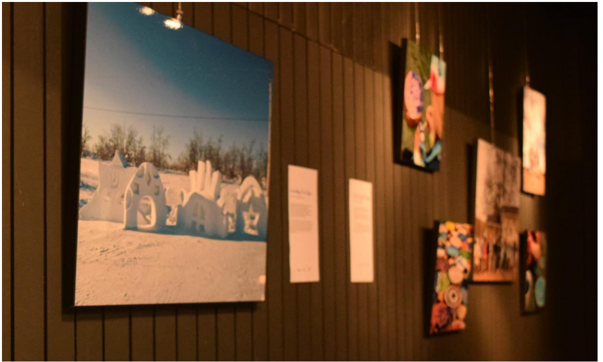
Fig. 49.

The exhibition's aim was to create another community art event to Enontekiö. The exhibition continued the series of art actions in Enontekiö, inviting the inhabitants to experience art, expanding the action to wider audience. According to Naukkarinen (2003, 73), the exhibition made our project even more public, being in a public place where any pass-byers could have come and unintentionally experience art, disseminating of research process among local people and other visitors in the nature center. Also, according to Cartiere (2009, 15) publicly funded and located art practice, can be identified as public art. Therefore, the exhibition promoted the aims of the project as sustainable public art practice. The art works exhibited was mostly documentations, installations of tools and atmospheres collected in the project. The aim was to openly implement the workshops, with concrete examples of the used materials. One purpose of the exhibition was to participate the community, also to those who didn't participate in the workshop.