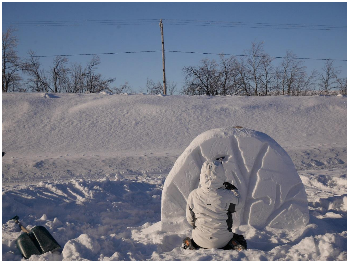
Fig. 22. Eutheum making final touches for the "Palojärvi sun"

The third day of the workshop was reserved for finishing and opening. Reflecting on the previous days' conversations with participants, we decided to make one more sun in the front of the local shop. This sun was more neutral, and we named it "the Palojärvi sun". (Fig. 22) Two persons from the workshops took part to the last days action and the opening. The atmosphere was very warm and friendly. Passersby stopped to wonder the activity and we got a chance to advertise the other sun sculptures further away from the local shop. There was also a short video made and published in the Enontekiö Art Path projects social media channels.