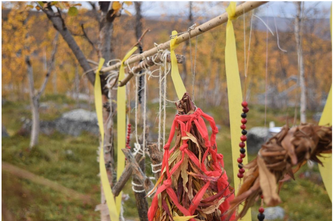
Fig. 41