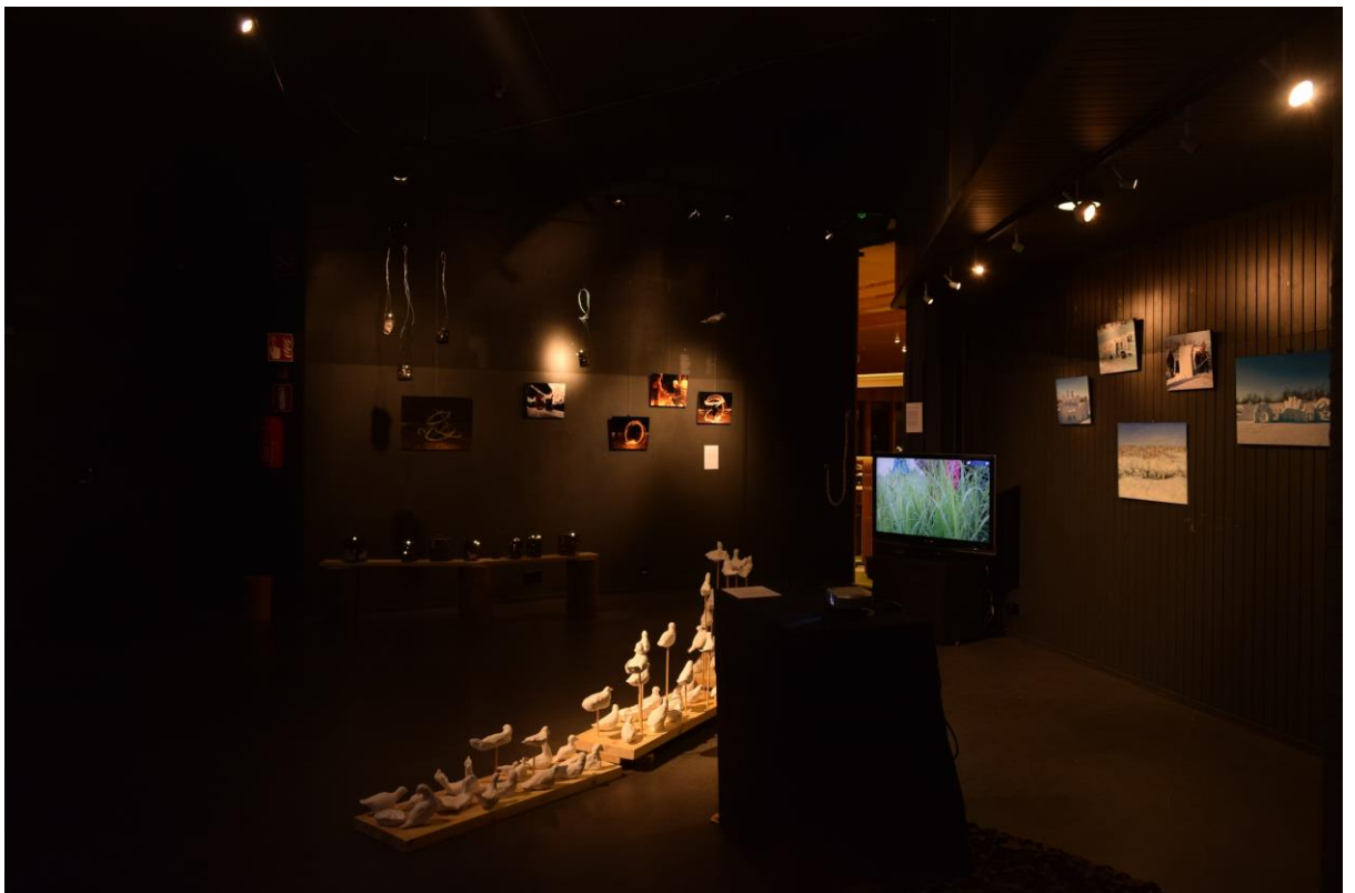
Fig. 48.

Our Enontekiö Art Path project exhibition was built to one of the galleries in the nature center. It was produced together with the team, our supervisor, two locals and one worker from the center. Building was good venue to memorize the workshops and reflect on the outcome. The curation was done by the team together with supervisor Elina Härkönen. Exhibition consisted of different elements: Photographs from the workshops, videos, GIF's, installations of the materials used in the workshops, works from the previous year's projects and our own art pieces, made from the project reflections (Fig. 48-49).