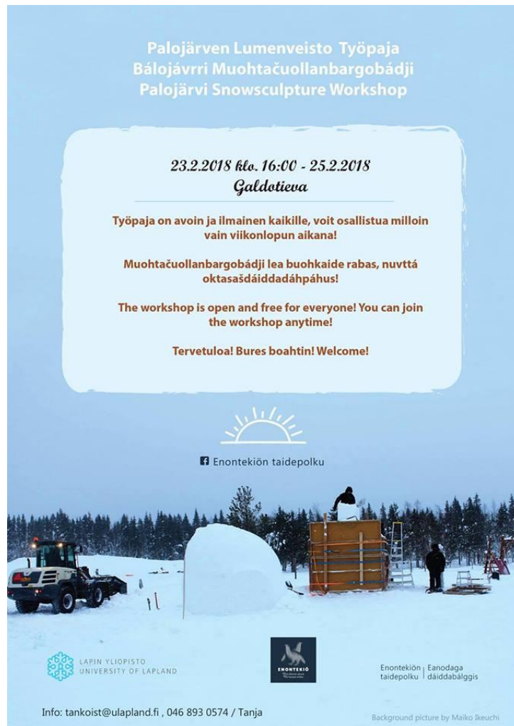
Fig. 15. poster design by Amisha Mishra, translated into northern Sami by Sami parliament translation center.

Palojärvi workshop (Fig. 15) idea of snow sculpting came from local's initiative. Palojärvi is a very small beautiful village close to the Finnish-Norwegian border, in the reindeer herding area of Näkkälä. Palojärvi, with its approximately 20 permanent inhabitants, is one of the most rural villages of Enontekiö. In February in Palojärvi the snow is a predominant texture, when one of Finland's coldest village is covered up to 1 meter or more snow. In February also the sun is up, and the polar nighttime is in the past. Addition to this, Palojärvi, on local's phrase "is a place where nothing happens". Artistic practices could be welcome and refreshing.