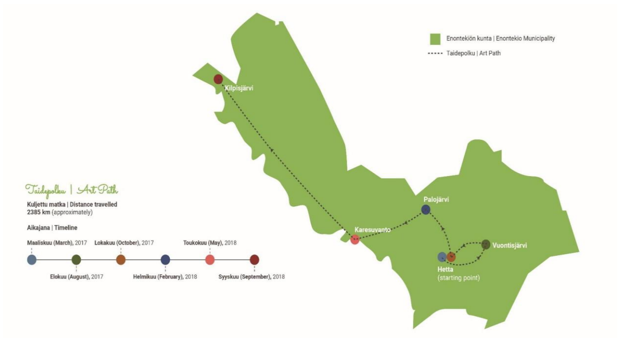
Fig. 4 Map of Enontekiö art path by Amisha Mishra