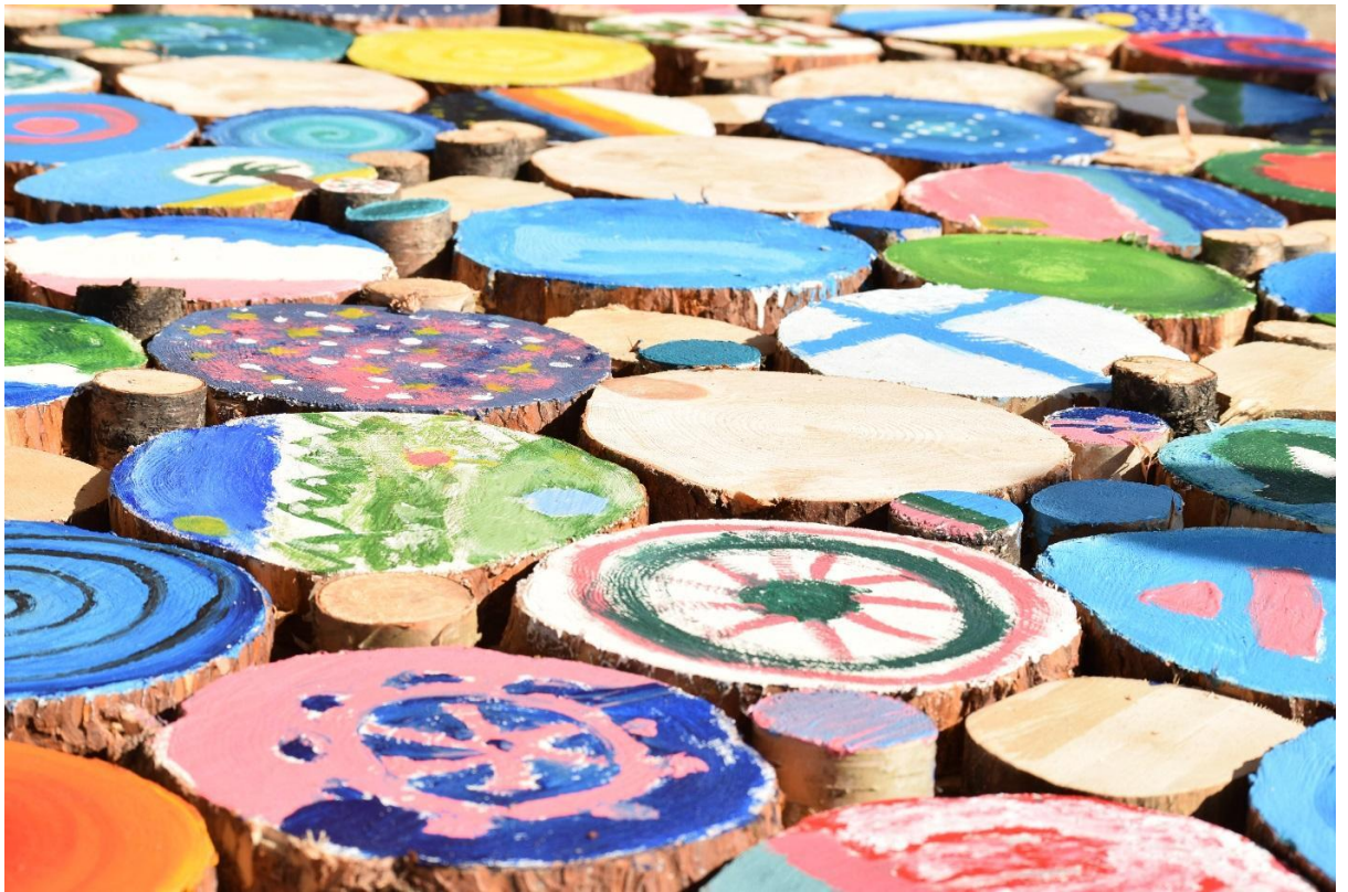
Fig. 29. For the final artwork, around 50 wood slices were painted after the first workshop day. They were left to dry at school for the next day's compilation of the final artwork.

The second and final workshop day included the hanging, the placing of the artwork and the opening. The day was busy, and the pupils participated to all practices. First, it was for the children to decide where they want their wood painting to be placed in the frame (Fig 29). The “frame” of the work was handed by the school’s janitor from schools’ storage. One teacher’s husband handed us wooden reindeer fence poles to build the structure. Also, the final place and the style was chosen by children among with the naming of the art piece. The school community was involved in all the decisions of the workshop. The final placement of the artwork is in a centric place in the village (Fig. 30), so the artwork not only participates the community member daily but also the pass-byers.