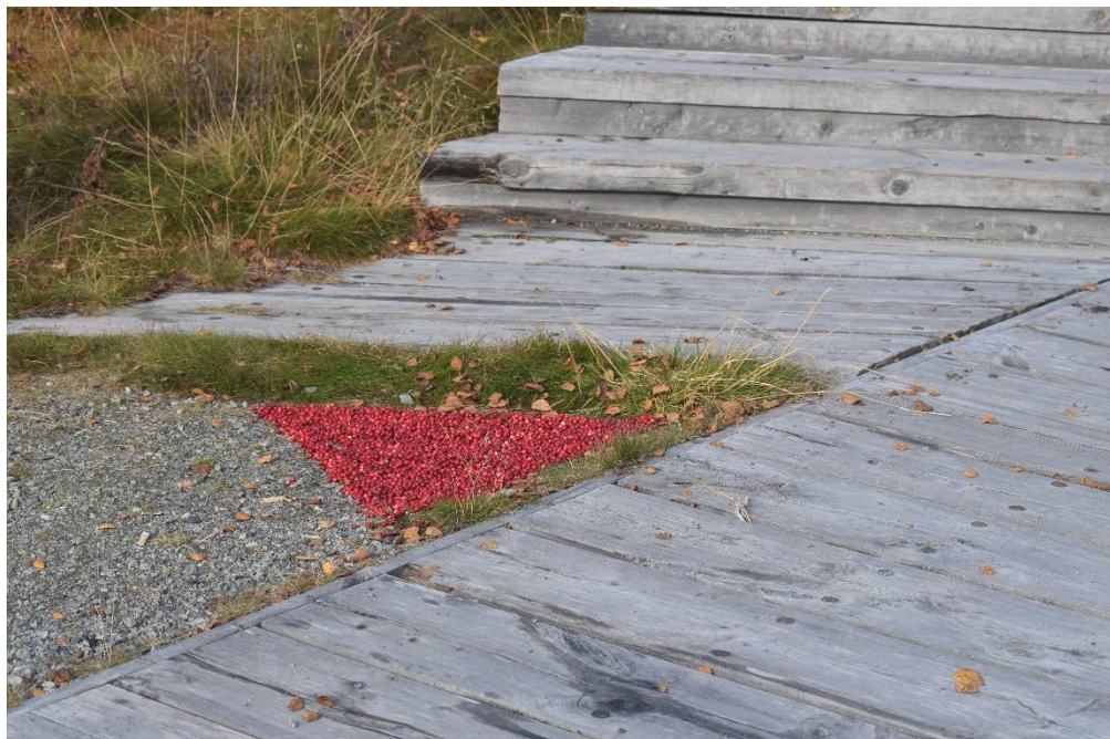
Fig. 45. Berry triangle symbolizes the wind.

Some participants wanted to do their own mobiles or drawing projects. Since this was an experimental art workshop, everything was possible. The project members found out, that this kind of practice can either be too vague for those who are not familiar with art, but also give many possibilities to those who are open to try. The second workshop day flowed with warm and interested atmosphere, and discussions were nature related. In the opening we introduced all the artworks made in the workshop.