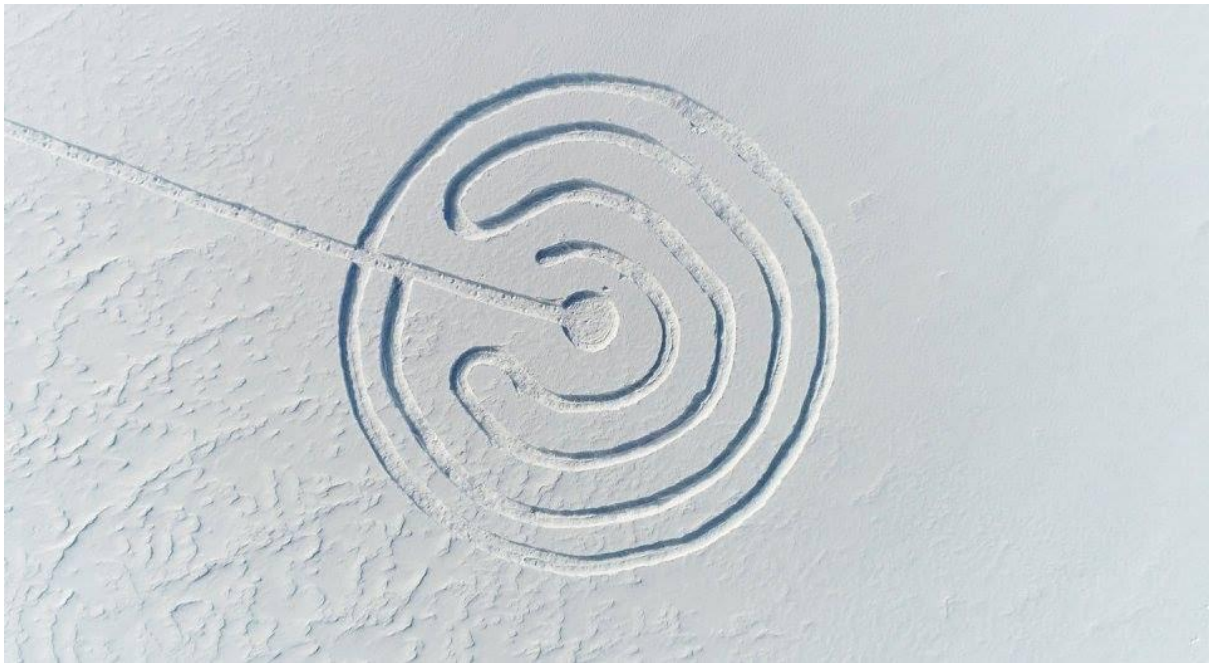
Fig 6 and Fig 7

Second workshop created environment art “Muistelohaasio” in Vuontisjärvi. The art practice was based on the old tradition of hay making in Lapland. The locals taught students the processes of preparing hay for different purposes. (Fig 8). During the workshop local narratives were shared and cultural heritage was discussed while making with hands. This workshop planned by Hiilivirta and Huang was successful with 20 participants and the artwork stayed on its place over one winter and the next summer. (Fig. 9)