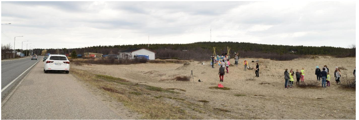
Fig. 30. The order of the wood slices in the frame was children's decision. (above). The final place of the artwork was on a sand bank, in a centric place in the village. (below)

The opening happened at the sand banks by the artwork (Fig 30). There was an open invitation for everyone to participate in the final building part, which happened just before the opening. There was around 10 participants addition to the school pupils and teachers, to help with the building. This group also included a couple of participants from previous workshops (Fig. 31).