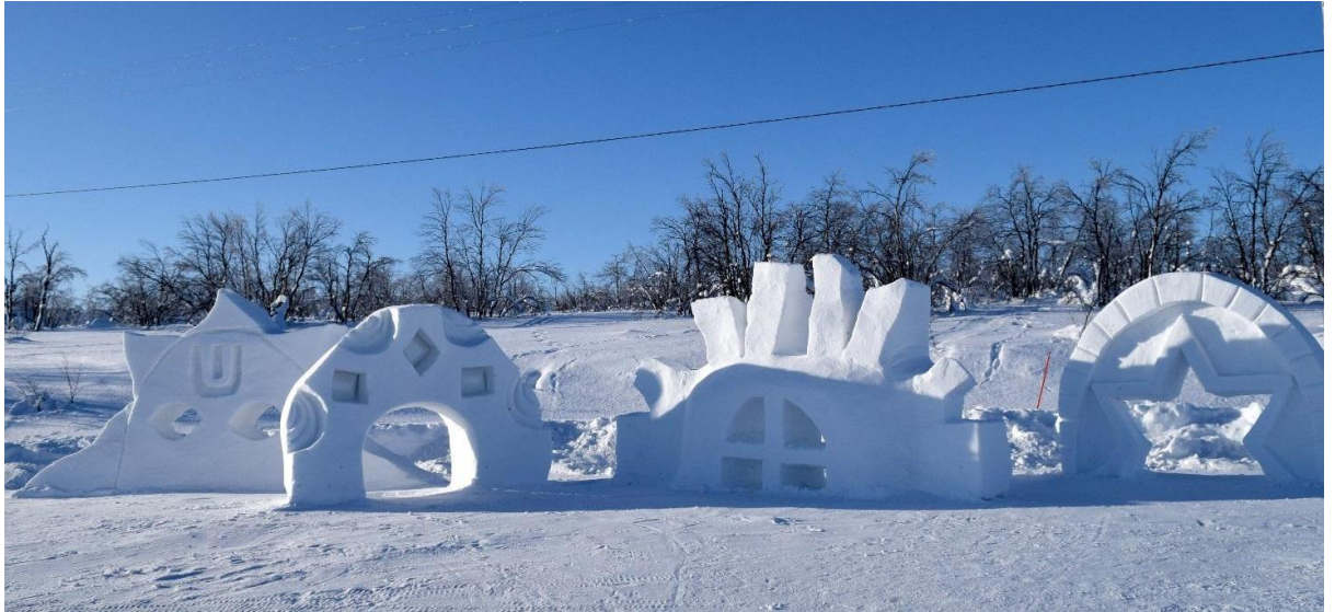
Fig. 20. Indian, Sakhan, Sami and Korean sun.

The place selected for these snow sculptures was a little bit far from village center. The village is very small, and the place where everyone stops is the local shop. The location our local contact suggested earlier was 1 km before the shop, when the one our supervisor selected is 2 km north from the centric location. We observed already in the second day of the workshop that our chosen location wasn't the best possible: It was unused parking slot space by busy road, and the sculptures were hard to see when passing by. The place was good place for the sculptures, but not in engaging the community. However, the location near the reindeer fence and the meaning of the sun god in reindeer herding traditions formed a meaningful narrative to the art.