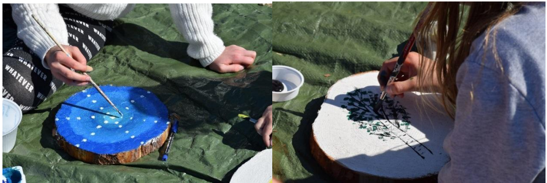
Fig. 25 and 26. The paintings on wood told a story about home village and the participants favorite places.

After the inside session the weather was warm and sunny, and the last parts of workshop were conducted outdoors (Fig. 25). Atmosphere while the workshop was warm and calm - everyone seemed to enjoy it. The team guided the pupils to paint their favorite place, or the color their favorite place to the wood slices. Meantime, the children told us about their experiences of places and home villages. Many places had a connection with the nature. (Fig. 26.)