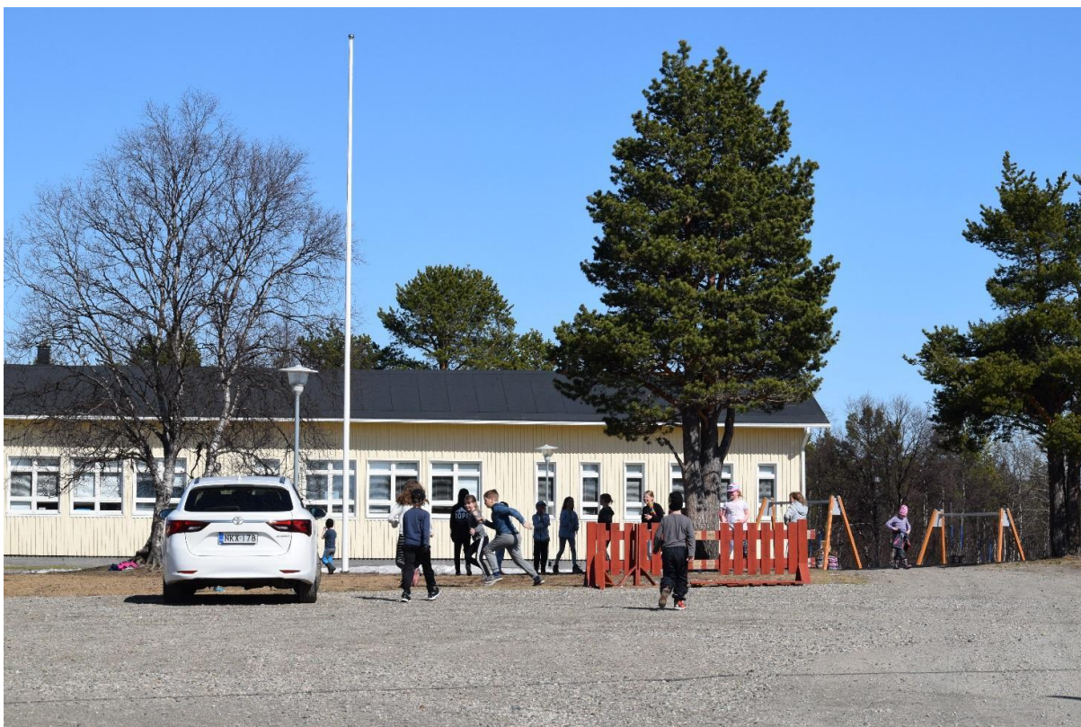
Fig. 23. The school yard was the venue of the first workshop day.

rather open possibilities. The arriving night the project members went to see the school yard to bring materials, and to see a possible working space (Fig. 23).