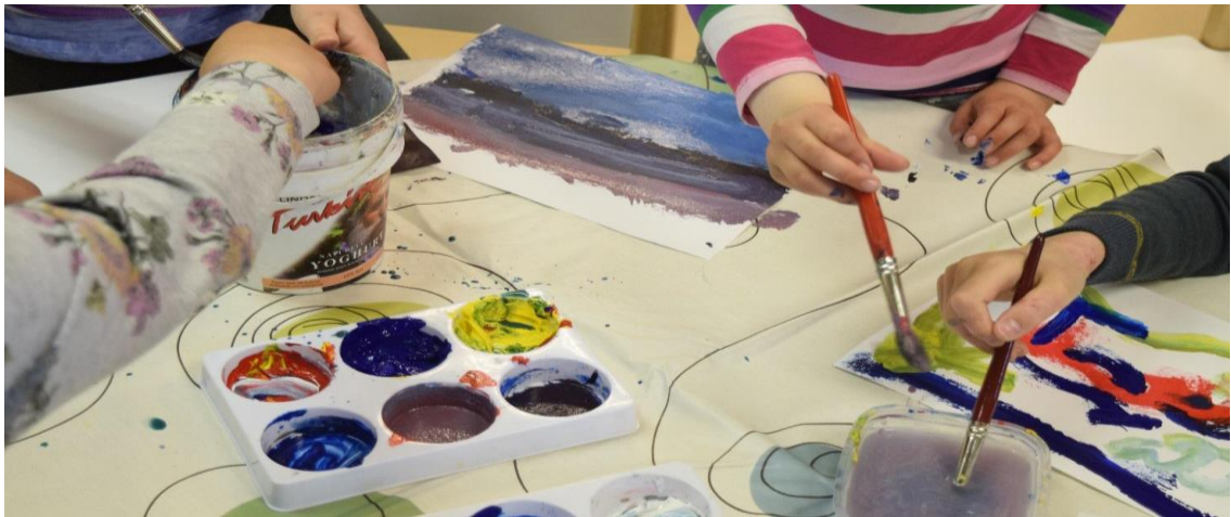
Fig. 24. Photo: Amisha Mishra. Children experimenting color mixes on paper.

After the inside session the weather was warm and sunny, and the last parts of workshop were conducted outdoors (Fig. 25). Atmosphere while the workshop was warm and calm - everyone seemed to enjoy it. The team guided the pupils to paint their favorite place, or the color their favorite place to the wood slices. Meantime, the children told us about their experiences of places and home villages. Many places had a connection with the nature. (Fig. 26.)