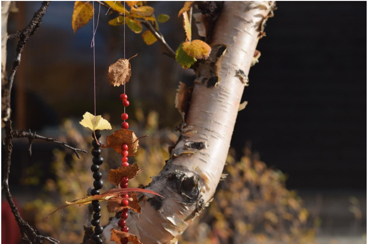
Fig. 43. The wind mobiles as a part of the landscape.

The second day of the workshop had more open concept compared to the children's workshop day. The wind mobiles were already hanged as an example what could be done. Participants were welcomed to collect materials and get inspired from the children's wind mobiles. Addition to this, the team designed a "wind mandala" (Fig. 44), which could be made together with participants from nature materials. Also, some triangle symbols, which is the symbol of the wind, were made using berries and stones (Fig. 45)