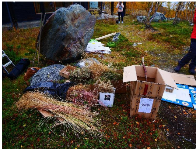
Fig. 35 and 36) Collected materials: hay, straws, berries, mushrooms, sticks, stones and flowers.

The children were excited to work in the nature with nature materials (Fig. 37 and 38). We noticed that this kind of practice is a good venue to share information about the local fauna, nature habits and seasons. Now it was the most colorful time of the year, the fall, which added value for the practice, when there was a lot of colorful material available.