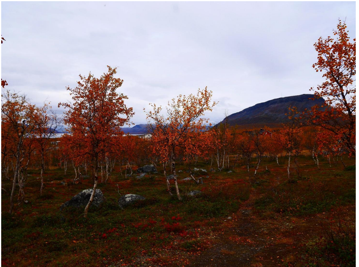
Fig. 33. Place of the workshop in Kilpisjärvi.

Based on the previous workshop good experience of working with local school, we decided again to participate the pupils. This time, we followed the same structure we had in Karesuvanto workshop: on the first day the pupils would join the workshop and on the second it will open participation. The workshop was advertised in local newspaper and social media channels.