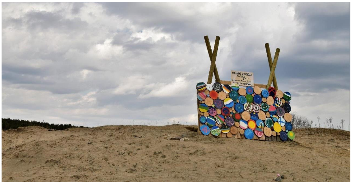
Fig 32.

The opening gained audience from the neighbors, pass-byers, pupils, and media. YLE Sami was present in the opening, interviewing the children about the artworks. The story was published in the YLE internet news and radio. The art works gained the communities respect: after few weeks from the workshop, we were contacted from one village that the wind had collapsed the work. Few days after the team got information from the community: they had gathered a group of people to pull the artwork up again and fixed the fallen parts. Few months after, when the snow had arrived, the artwork still existed on its place, and the community members have regularly been cleaning it from the snow. The team considered the workshop gained its goals, by creating colorful and eye-catching permanent artwork, for the community and for the pass-byers to enjoy and for the community to own (Fig. 32).