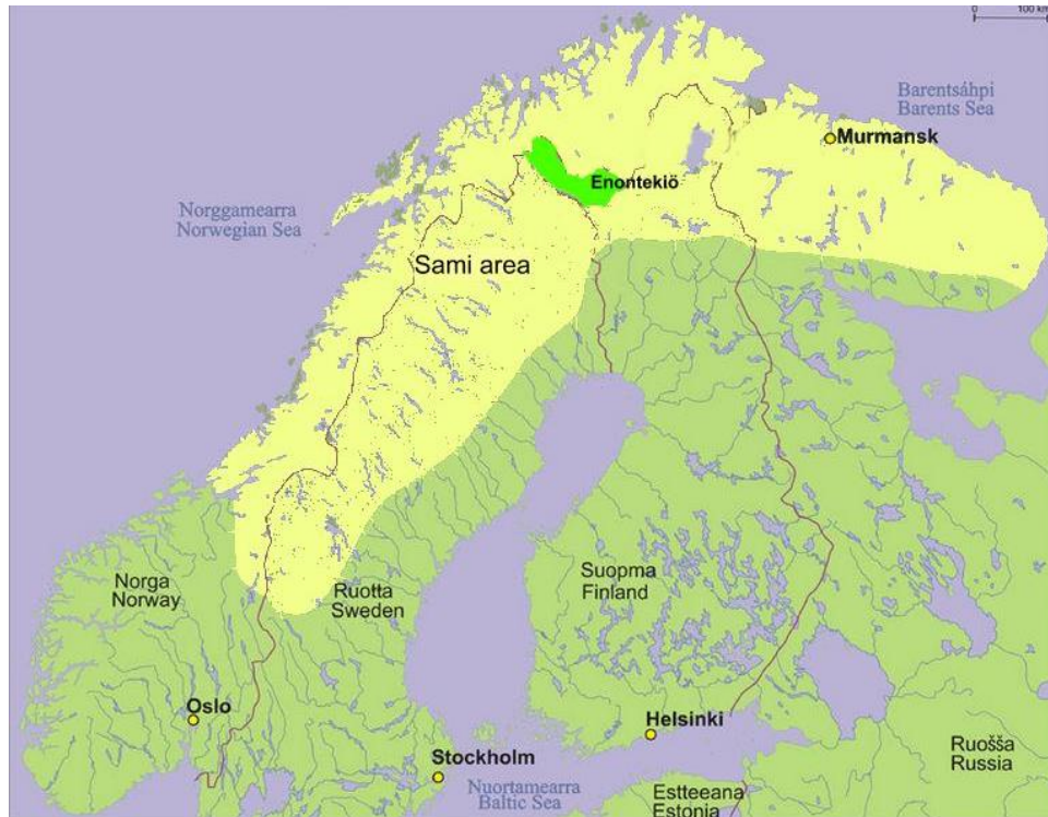
Fig. 2. Enontekiö placed in Scandinavian Map and Sami area.

(Kärnä, 2013, 18–19). Enontekiö is Finland's coldest area with average temperature of -2 degrees Celsius.