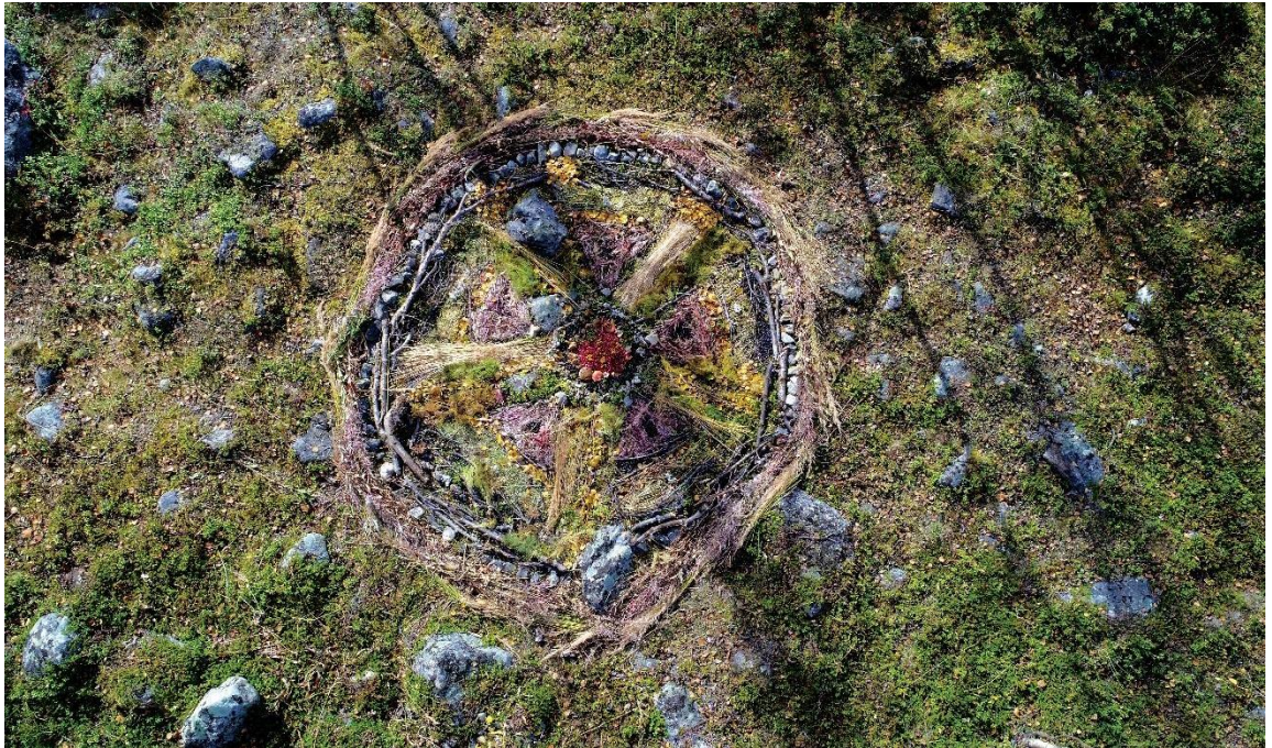
Fig. 46. Our first workshop day with the children from Kilpisjärvi.