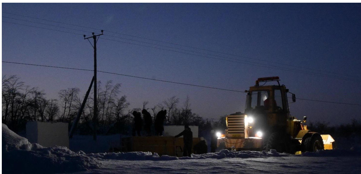
Fig. 18. 1st part of the workshop: Filling the snow molds, with the help of a local.

The workshop started from a local food store where we waited participants to arrive. Posters of the workshop were placed around the area for a few weeks before the workshop and they had also been spread in the social media channels. In the local store we made a few contacts with the villagers, who were wondering the new faces arriving to the village. In this point we faced some language barrier; English wasn't commonly spoken, and I was mainly responsible connecting with the locals. In the store, we couldn't participate anyone to the first part of the workshop, which was the filling of the molds. For participating we tried again straight forward, face to face invitation.