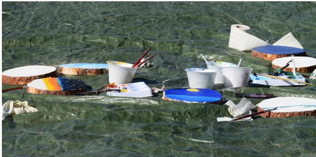
Fig. 27. During the painting, the weather was sunny and warm, and the atmosphere relaxed and concentrated.

The challenge of this workshop was the documentation. In Finland photographing children needs special consents. To have that, we needed to have pre-arranged form for children to fill in their homes by their parents. Some got permission and some not, so we decided to mostly concentrate on the hands, not take photos on their faces (Fig. 28)