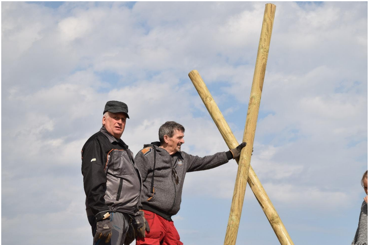
Fig. 31. Two participants drove over 80 km to participate the workshop's last part.

The opening happened at the sand banks by the artwork (Fig 30). There was an open invitation for everyone to participate in the final building part, which happened just before the opening. There was around 10 participants addition to the school pupils and teachers, to help with the building. This group also included a couple of participants from previous workshops (Fig. 31).