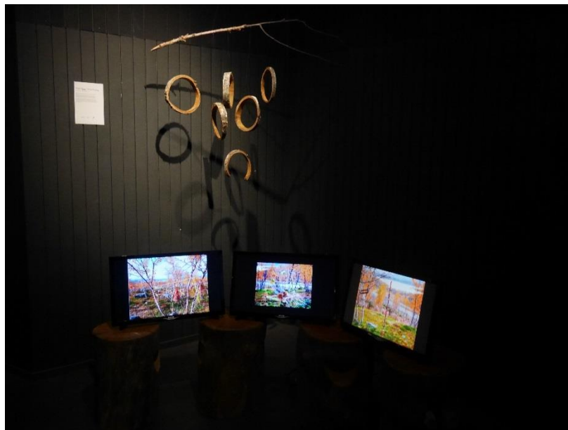
Fig. 52. The appearance of the wind workshop in the exhibition.

workshop, pictured the wind workshop (Fig. 52). This artwork carried out the contents of Kilpisjärvi workshop through its material choices and subject. The materials and theme were local, telling a local narrative of a nature phenomenon. Based on this, and Lippard's (1997) definitions, also this work described the principles of sustainable community art practices.