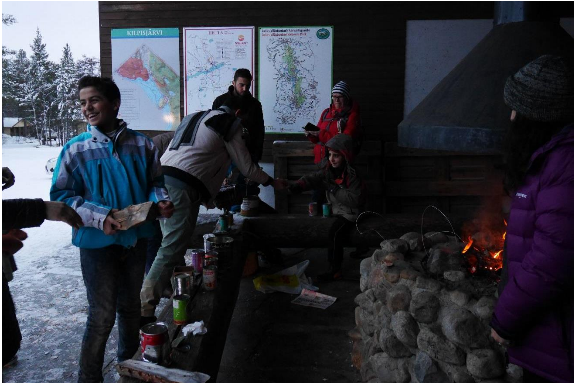
Fig. 12 Building the torches by the fire with Syrian asylum seekers.

recycled cans were transformed to fire torches by the participants. Team build a place outside near the fire, where everyone passing-by were able to participate or just look at the practice. (Fig. 11)