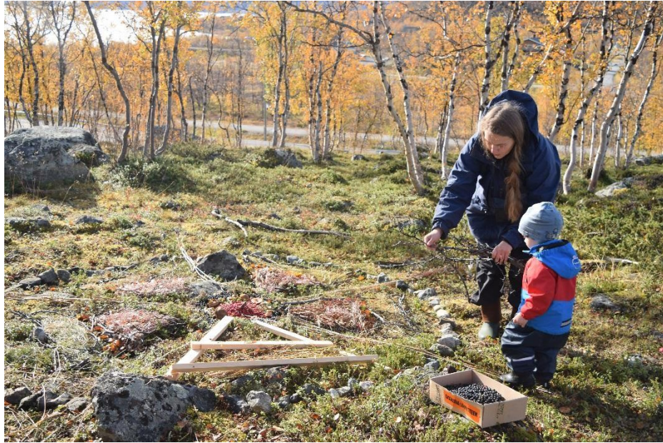
Fig 44 The youngest participant and I making the wind mandala.

Some participants wanted to do their own mobiles or drawing projects. Since this was an experimental art workshop, everything was possible. The project members found out, that this kind of practice can either be too vague for those who are not familiar with art, but also give many possibilities to those who are open to try. The second workshop day flowed with warm and interested atmosphere, and discussions were nature related. In the opening we introduced all the artworks made in the workshop.