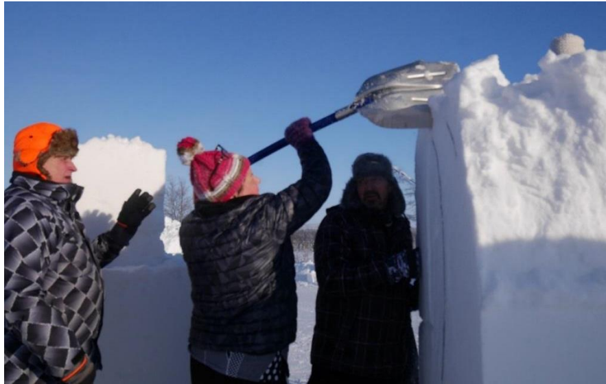
Fig. 19.

Huang in their own village in the first part of the project. A man, who we engaged to this workshop from the local shop, was hesitated to try sculpting. Instead, he was willing to use the snow pusher and clean the area. The other two participants were more eager the learn snow sculpting, along with those who had already participated the first workshop day.