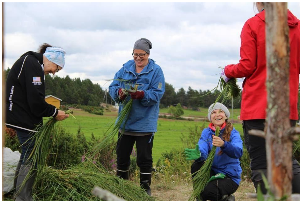
Fig. 8

Second workshop created environment art “Muistelohaasio” in Vuontisjärvi. The art practice was based on the old tradition of hay making in Lapland. The locals taught students the processes of preparing hay for different purposes. (Fig 8). During the workshop local narratives were shared and cultural heritage was discussed while making with hands. This workshop planned by Hiilivirta and Huang was successful with 20 participants and the artwork stayed on its place over one winter and the next summer. (Fig. 9)