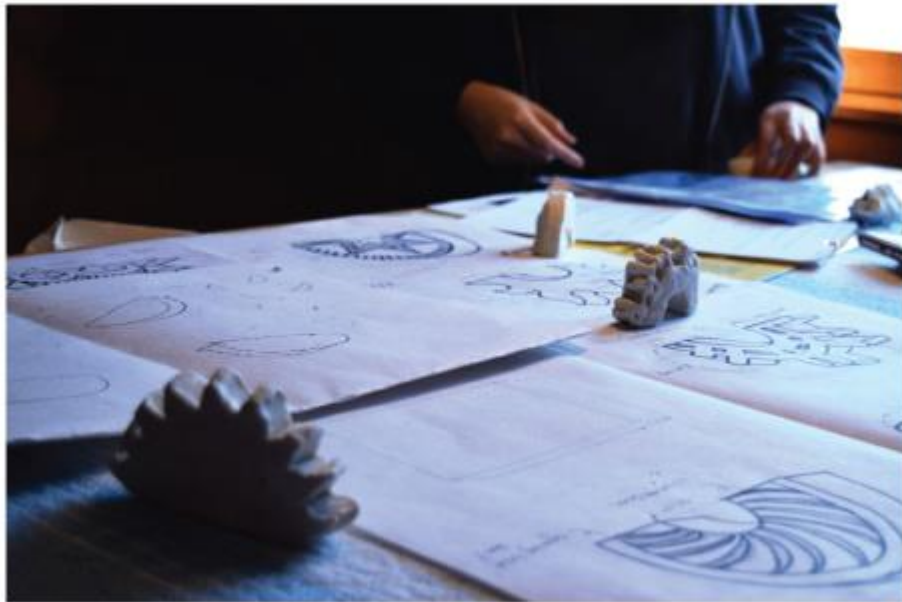
Fig. 16. Amisha Mishra. Modelling the snow sculptures with white wax, based on the sketches.

Our contact suggested a place for the sculptures in the crossroad of two villages, Näkkälä and Palojärvi. Our supervisor saw a possibility to make the snow sculptures beside the main road to Norway, next to a large reindeer fence (Fig. 17). The place was characteristic, and had plenty of snow, so we decided to make the sculptures there. The conditions were unsure in the place local suggested; the team didn't know whether the tractor, used for filling the snow molds, could have gone to the place local suggested.