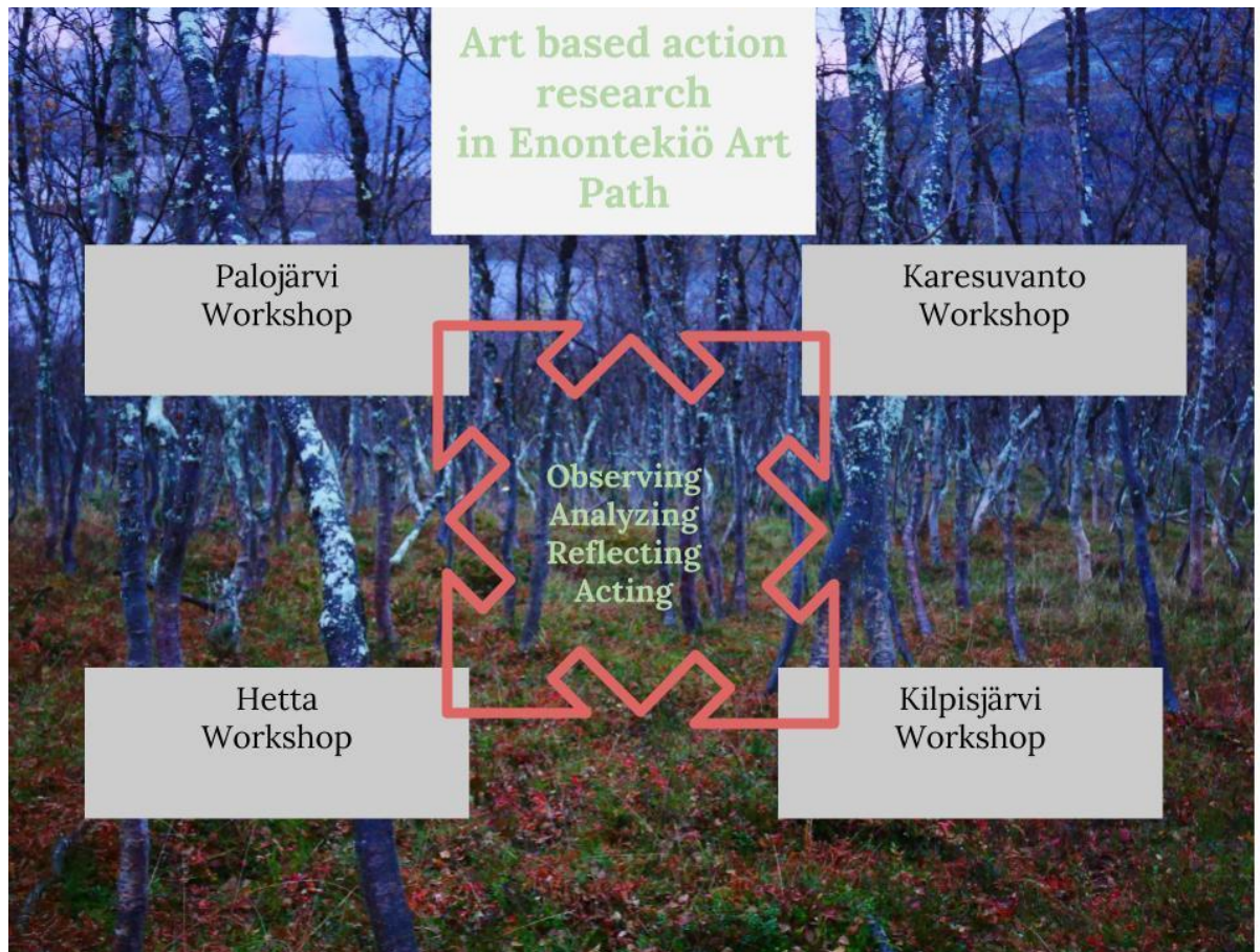
Fig 1: The cycle of art-based action research applied to Enontekiö Art Path project.