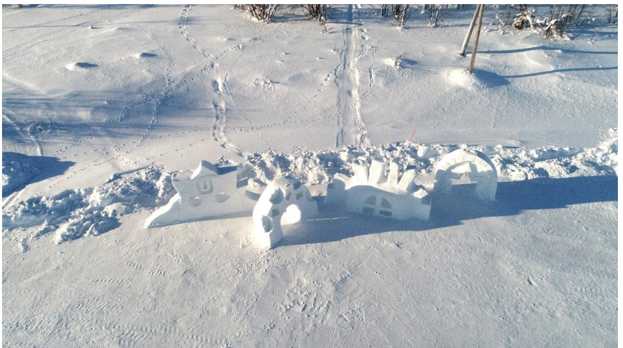
Fig. 21. The sun sculptures shoot from drone.

The place selected for these snow sculptures was a little bit far from village center. The village is very small, and the place where everyone stops is the local shop. The location our local contact suggested earlier was 1 km before the shop, when the one our supervisor selected is 2 km north from the centric location. We observed already in the second day of the workshop that our chosen location wasn't the best possible: It was unused parking slot space by busy road, and the sculptures were hard to see when passing by. The place was good place for the sculptures, but not in engaging the community. However, the location near the reindeer fence and the meaning of the sun god in reindeer herding traditions formed a meaningful narrative to the art.