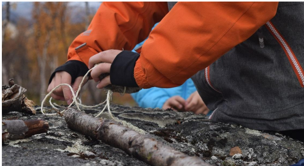
Fig. 37 and Fig. 38. Children working with the nature materials.

Some children found garbage from the surrounding areas, and instead of nature materials they used those to make a garbage mobile. This pointed out there is a lot of waste in the nature, even in national park area, and the pupils of this group wanted to do a wind mobile with an environmental statement.