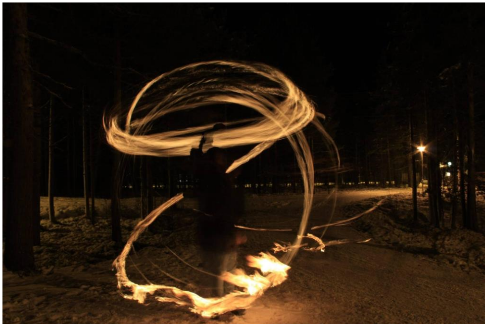
Fig. 13. Outcome of the play; long exposure fire photographs.

safety. During the play we observed that the Syrians had more courage to play with the fire than the locals originally from Enontekiö. One of the reasons might be that in Lapland, according to my childhood experiences, the children are taught not to play with the fire. The fire is many times inside the houses and getting too familiar with the fire might cause accidents. Fire is essential element in Lapland: to keep warm, to cook food and to gather people around it. The final artwork of this workshop was the documentation with long exposure photos, which were published in the project's social media channels and later as prints in the final exhibition (Fig. 13).