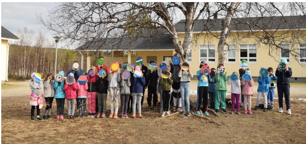
Fig 28 The artists of Karesuvanto workshop: 27 children.

The challenge of this workshop was the documentation. In Finland photographing children needs special consents. To have that, we needed to have pre-arranged form for children to fill in their homes by their parents. Some got permission and some not, so we decided to mostly concentrate on the hands, not take photos on their faces (Fig. 28)