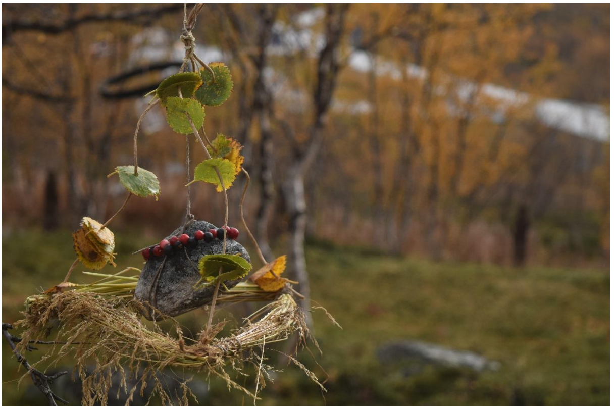
Fig 42: Amisha Mishra