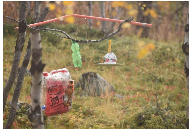
Fig 39 and Fig 40. The stone mobile and trash mobile made by children.

The finalized wind mobiles were hanged in the surroundings areas of the nature center in Kilpsijärvi (Fig. 39 and 40) For the hanging, we used paper twine and natural rope (Fig. 41 and 42). The pupils of Kilpsijärvi school introduced their own pieces one by one. It's was obvious that they were very proud of their works. The outcome of the children's workshop day was GIF videos, which were published in the Enontekiö Art Path project's social media channels (Fig.43)