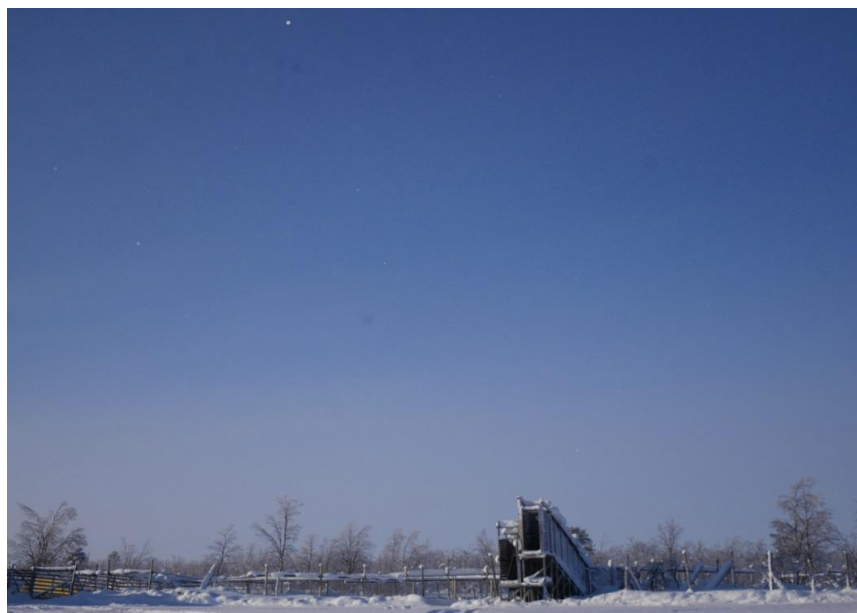
Fig. 17. Reindeer fence.

Our contact suggested a place for the sculptures in the crossroad of two villages, Näkkälä and Palojärvi. Our supervisor saw a possibility to make the snow sculptures beside the main road to Norway, next to a large reindeer fence (Fig. 17). The place was characteristic, and had plenty of snow, so we decided to make the sculptures there. The conditions were unsure in the place local suggested; the team didn't know whether the tractor, used for filling the snow molds, could have gone to the place local suggested.