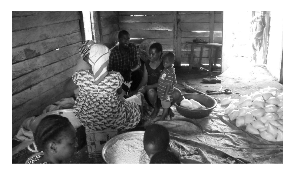
Figure 2: Meeting with farmers at Boviongo. The authors' field data gathered in 2017.