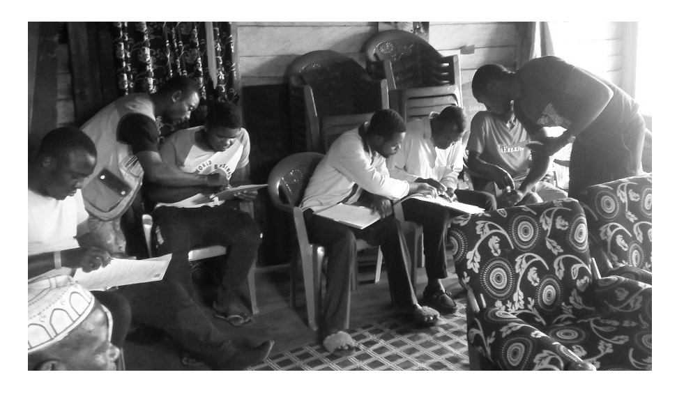
Figure 3: Conducting interviews at Munyange. The authors' field data gathered in 2017.

According to Doody et al. (2012), focus groups help researchers disclose knowledge uncovered by other methods of data collection. Consistent with this view, we reviewed unpublished data obtained from the MCNP office in Buea, targeting assessment and monitoring reports written between 2009 and 2016 by park officials, for the 41 villages around MCNP. Using this data, we were able to determine villages associated with the use of forests. To identify villages in contact with the park, we adopted Maxwell and Miller's (2008, p. 462) principle of