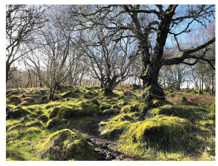
Figure 1. Càrnach woodland, Image: Mairi Summers, 2023.

the land that is now designated as crofts, over the croft that I now tenant. On the croft there are many piles of stones – land clearance cairns – formed when people were preparing the land for growing crops or grazing animals, many years ago. I have been told that smaller stones would be piled on top of large stones that were too difficult to move. These land clearance cairns now provide habitat for myriad beings.