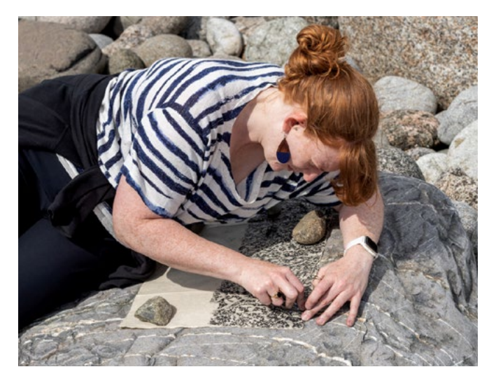
Figure 3.. Graphite frottage at Rotsidan, Image: Mari Parpala, 2023.

In my practice I am focusing more and more on what I think of as 'attentional practices', - activities which attune my perception to being both outward and inward simultaneously. Somehow holding the space between, as one might in a daydream. This quality of attention brings me into a 'togethering' (Ingold 2017) with other. It is a difficult balance, and hard to express since it is an intangible process. In this instance I was using the process of frottage as a method of staying within that attentional space.