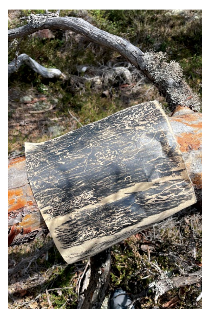
Figure 7. Bark beetle larvae trail patterns.

Ingold, T. (2017) Correspondences [online]. Aberdeen: Aberdeen University. Available from <u>https://</u> <u>knowingfromtheinside.org/files/correspondences.pdf</u> [5 August 2022]