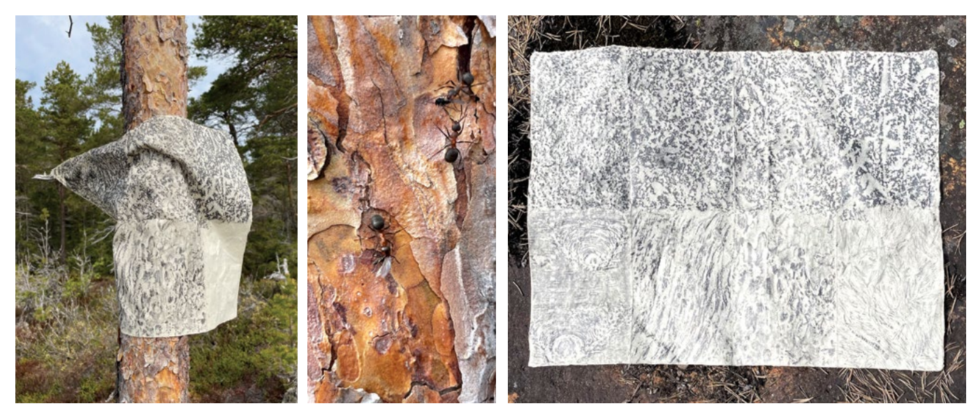
Figure 4. Graphite frottage on Scots Pine tree. Figure 5. Detail of ants on Scots Pine bark. Figure 6. Completed frottage map, four from stone, four from tree.

Another day, we followed blue way-markers up Högklinten mountain to see extraordinary, raised cobble fields high amongst the trees. The journey up drew my focus to the summit; the heat of the day, the effort involved, the unknown distance, all caused me to press on upwards. I found myself reflecting on how my creative attention was congested by these various stresses.