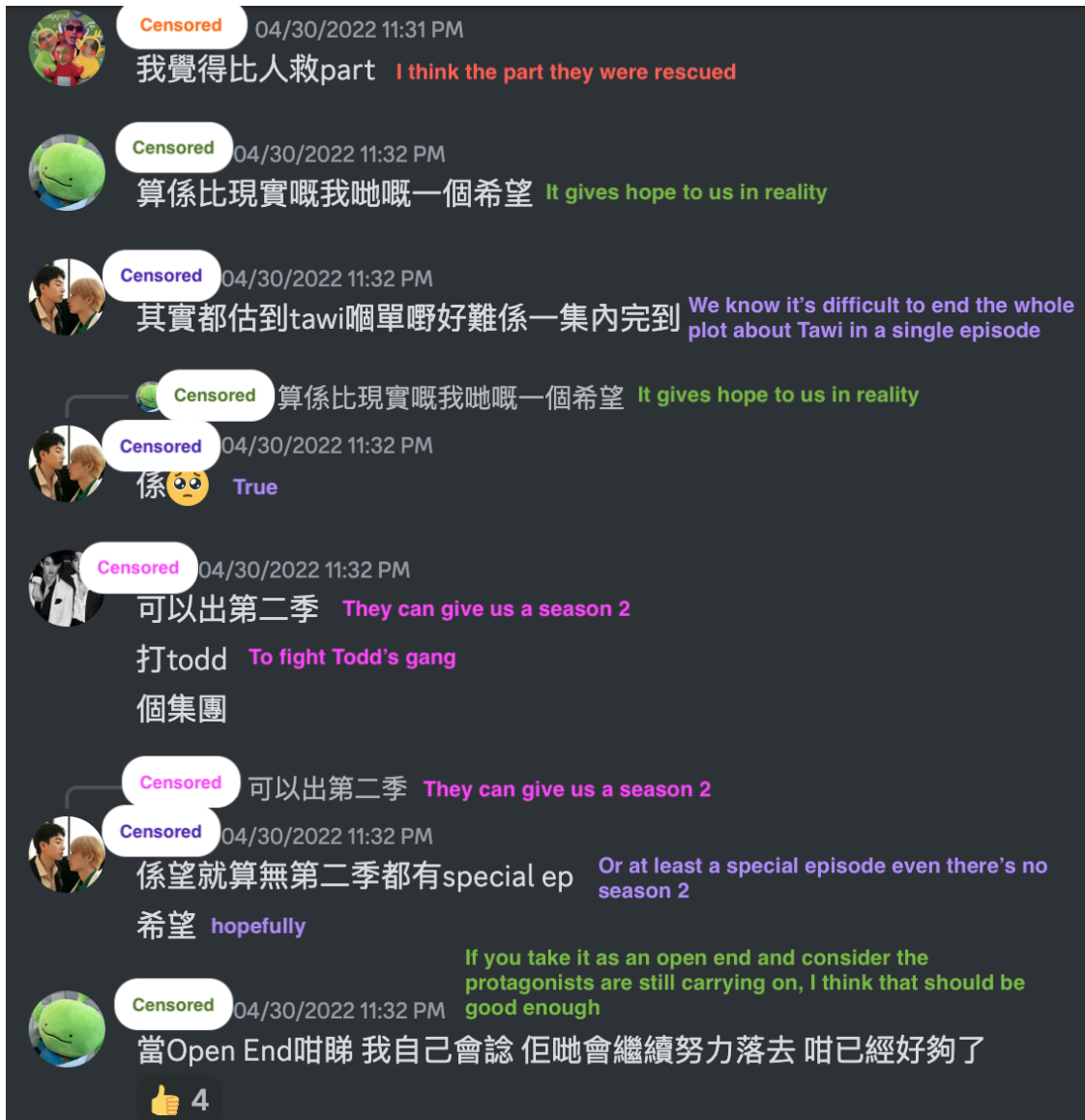
Figure 7. Chatroom of discord live session