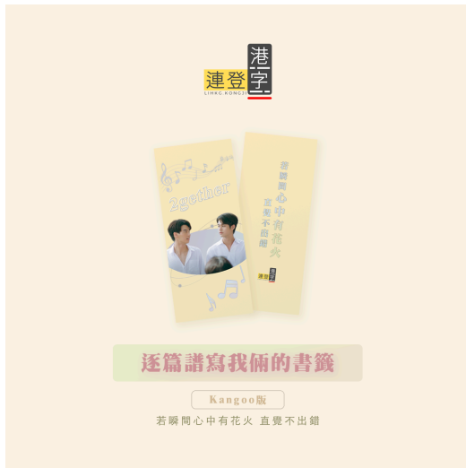
Figure 8a - 8f. Souvenirs for audience participating in private screening