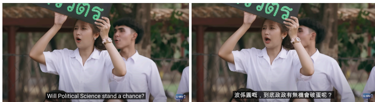
Figure 2b. Cantonese subtitles with “Everything is possible” - famous quote by Hong Kong former sports news reporter Ng Fong Wing

As time goes by, more members have started to learn Thai and more newcomers capable in Thai language join the fansubbing group. The deviation of translating from