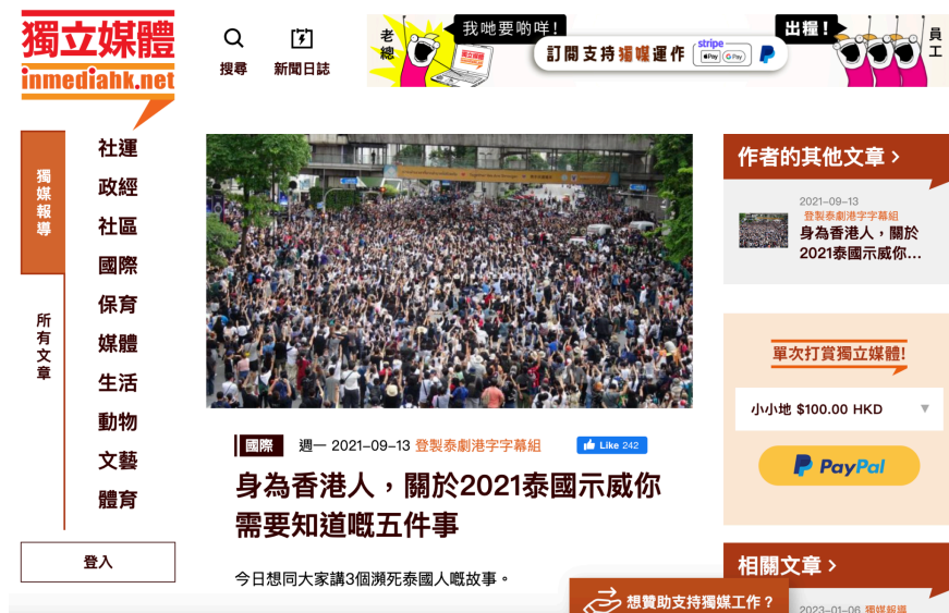
Figure 6. Article by Kongji Production members submitted to inmediahk.net

We also observed that Thai people tended to express their political views with pop culture. In early protests in 2020, students often referenced pop culture, such as Harry Potter, Hunger games and Japanese anime Hamtaro. Like McCargo (2021) described, the early protests had a “carnavalesque atmosphere, as seen in the witty appropriation of icons from popular culture” (P.179). In 2021 we started to translate a new action drama series Not Me produced by GMMTV. The story depicts the injustice, corruption and civil rights infringements of Thailand and the strong will of the youth generation to bring changes through political activism. Mise en scène of the series deliberately included Thai political artists’ painting, socio-political books of Thailand as props, and rap song composed by Thailand rappers to criticize the incompetence of the government and unjust social situation. Members at first intended to write supplementary information in the subtitles for audiences’ better understanding of context. However the knowledge, if included in the subtitle, would lower its readability as the lines were too long. We therefore created a new Instagram account column to post these “easter eggs” we gathered for audiences interested in learning more about the social context of Thailand. When we completed translating the 14 episodes of Not