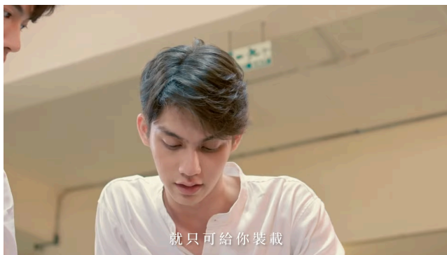
Figure 5. Kangoo Cantonese cover

Later we continued to write Cantonese lyrics for several Thai songs, mostly soundtracks of 2gether the Series and its special sequel Still2gether the Series , and some other soundtracks from other Thai TV series. Members including myself worked on different themes when we wrote the lyrics. Sometimes we got inspirations from story plots of respective TV series and wrote the lyrics that were reminiscing the dynamics between protagonists. Sometimes we voiced our grief for the aftermath of social movement, our turmoil and aspirations for future changes in our lyrics.