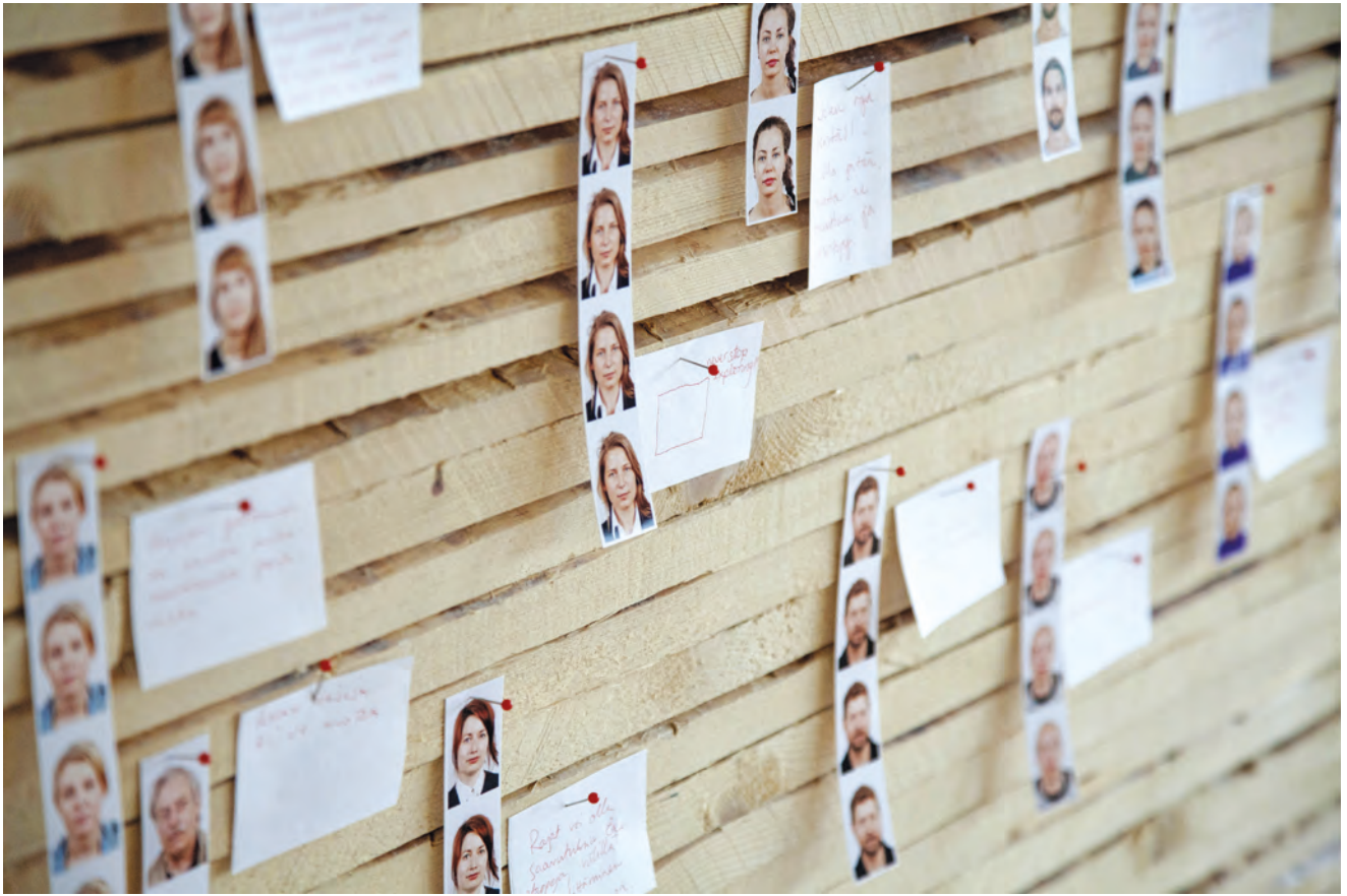
Image Right: In addition to writing, participants used drawing to tell their thoughts.

Image Left: The photo shoot equipment gave a formal sense to the photos.