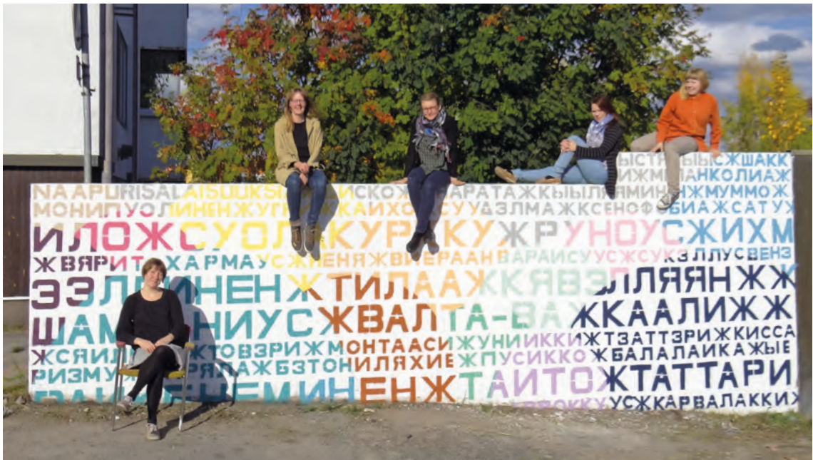
Artists enjoying their finalized artwork. The wall was painted back to white later. Alphabet Images: Neighbour-secrets on the wall of Kauppapyhtiö.

Finally, it was a pleasure to see the results of the workshop also resonating with the mural made by one of the biennial's artists, Carolina Falkholt. Every city deserves street art; permanent paintings on a big scale as well as temporary works such as Neighbour-secrets.