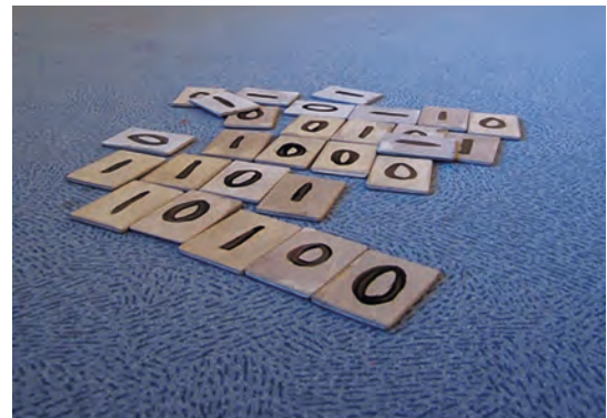
Binary codes made for the Art Picnic.