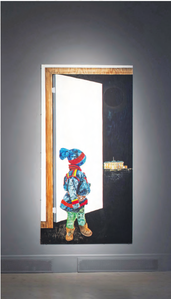
Piece of Anders Sunna's North Gate Collection. 200 x 100 cm (displayed in Luleå)