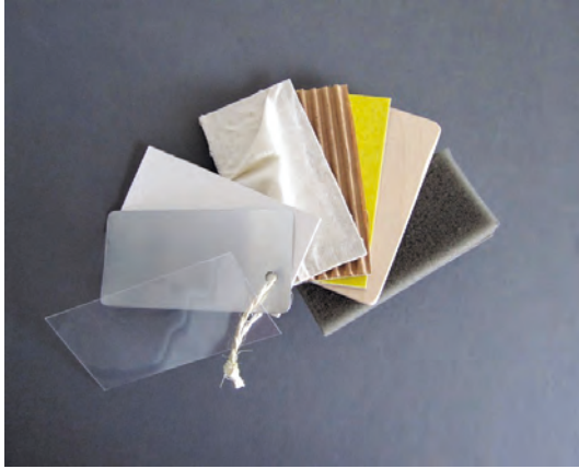
Pack of sensation cards

ticipant was given the bag. The Picnic concentrated on a few selected works that were examined with the tools found in the bag. At the end, all the children tied a red thread onto a cylinder made out of chicken wire, which functioned as a guestbook.