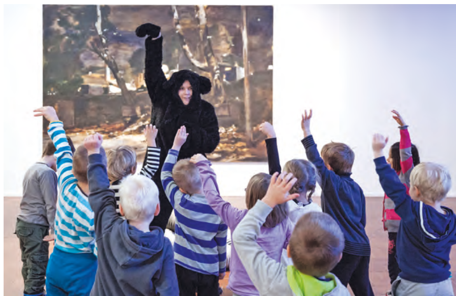
'Hullu Metsä' (Crazy Forest) -workshop Autumn 2014 Pöykkölä Day Care group in Rovaniemi Art Museum.