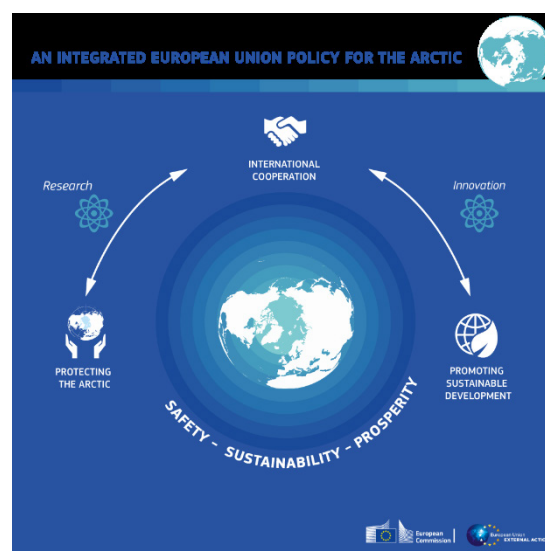
Infographic: European Commission, Twitter #EUArctic

The result is that the Communication – similarly to its predecessor – remains a set of “statements of fact rather than commitments to action, which appear to be in great part a continuation or intensification of existing activities at EU, bilateral or multilateral level”, as Airoidi (2014) concluded at the previous 2012 Joint Communication. The 2016 document largely constitutes a list numerous activities, studies, and projects that have already taken place and provides fairly few examples of actions yet to be taken: from existing satellite technologies, through on-going operation of the EU-Polarnet (formulating the European Polar Research Programme), to very specific projects to be continued, like the development of multi-resolution maps of the Arctic seabed. Proposals for future activities are few. The Communication is certainly not an action plan.