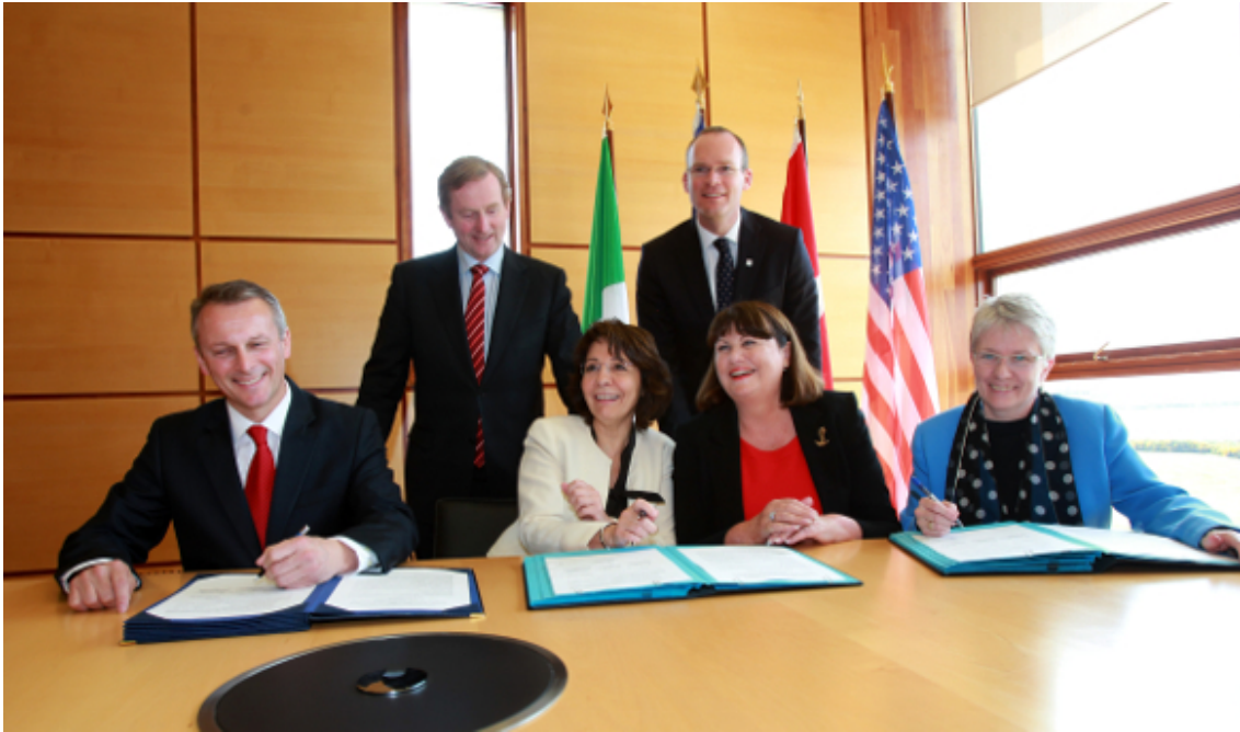
Signing of the Galway Statement on 24.03.2013.