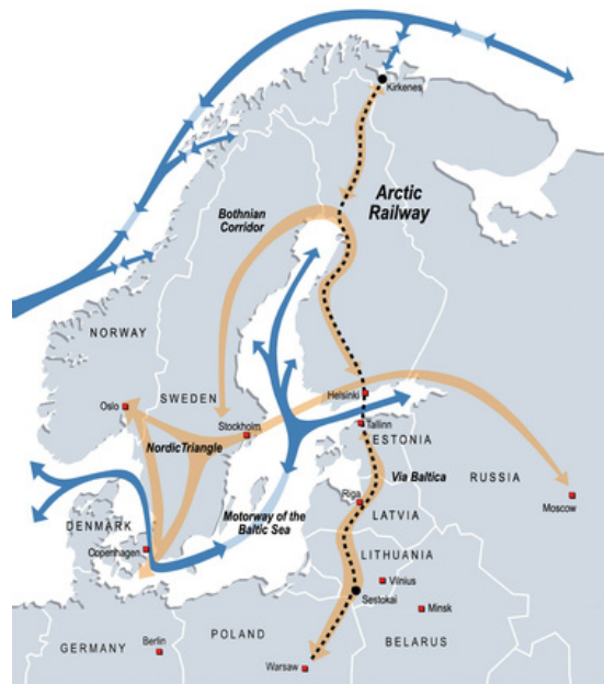
Arctic railway proposal between Gulf of Bothnia, Finnish Lapland and the Arctic Ocean.

The accessibility of the region could be also improved through hard infrastructure, such as through North-South transport connections. While the latter is merely hinted at in the new