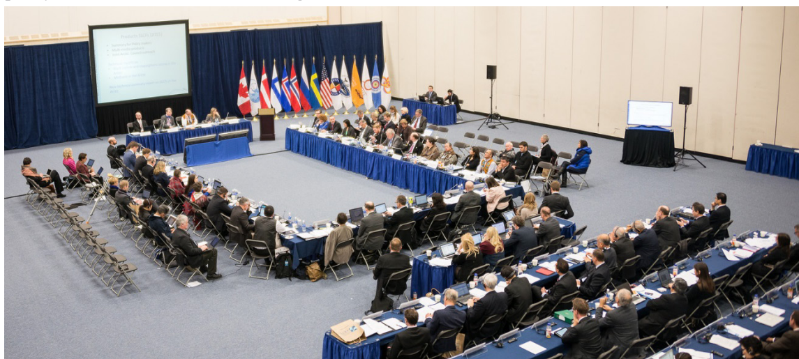
Arctic Council's Senior Arctic Officials' meeting in Yellowknife, NWT, Canada, 26 March 2014. Clear division between Arctic states and permanent participants (at the table) and observers in the back.