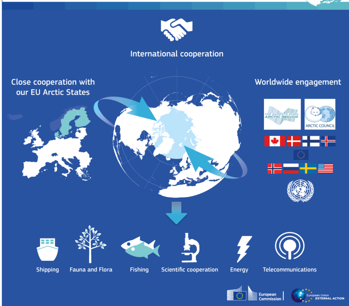
Infographic: European Commission, 2016, Twitter #EUArctic.

against the perception of the EU as a “super-regulator” and concentrating on environmental, climate change and research issues, supporting any effort to ensure the effective stewardship of the Arctic environment” (Keil & Raspotnik 2012). This conclusion also holds true for the 2016 Joint Communication. Eventually, science seems to be the internally agreed upon key should finally open the Arctic governance and cooperation door. The door to a neighbourhood that is generally perceived as peaceful and stable, embedded in a distinct cooperative environment. Accordingly, also the currently developed Global Strategy will essentially stress the cooperative path the EU wants to take in the