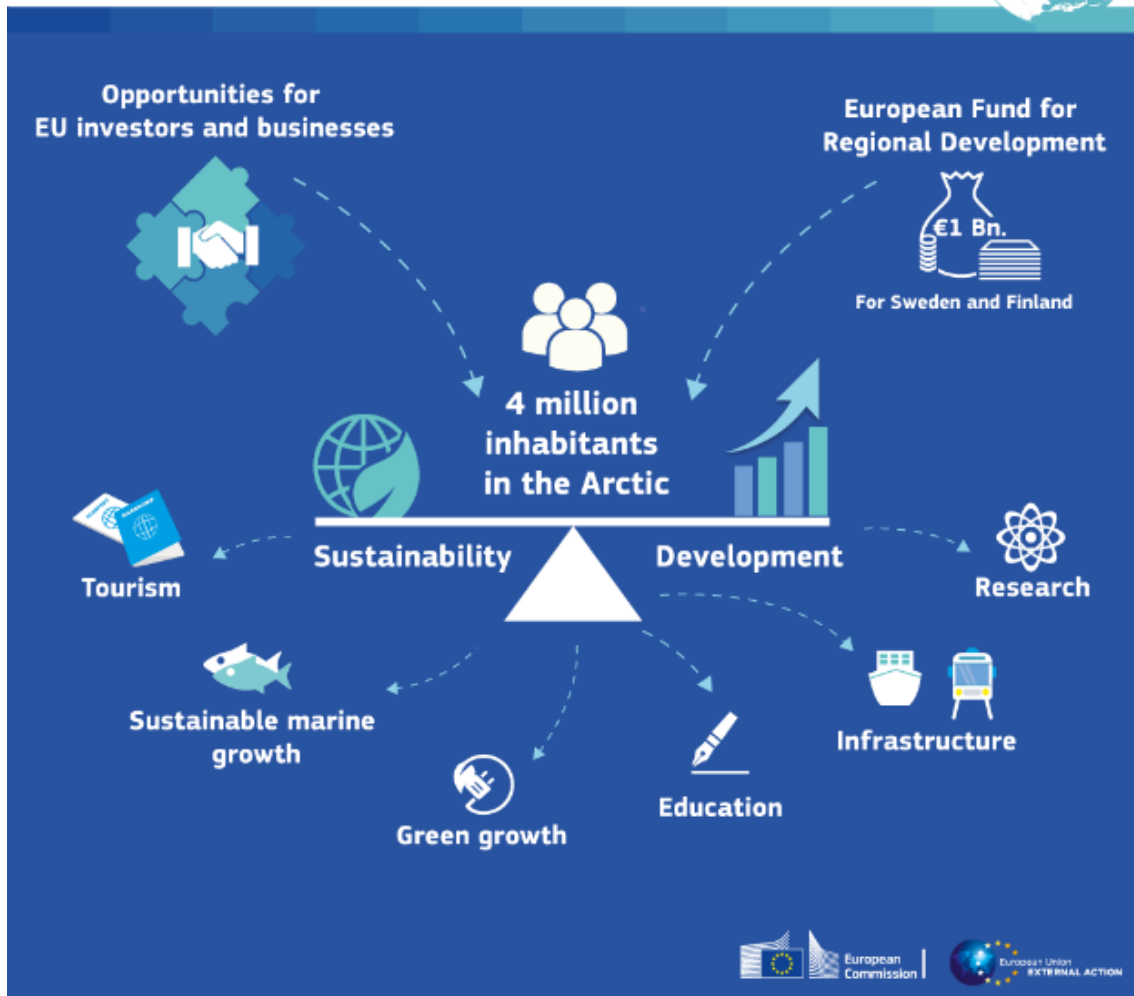
Infographic: European Commission, Twitter #EUArctic

into a national park and that its interest is solely in exploiting northern riches. Thus, the new document includes an assurance that sustainable development should be pursued “taking into account both the traditional livelihoods of those living in the region and the impact of economic development on the Arctic's fragile environment.”