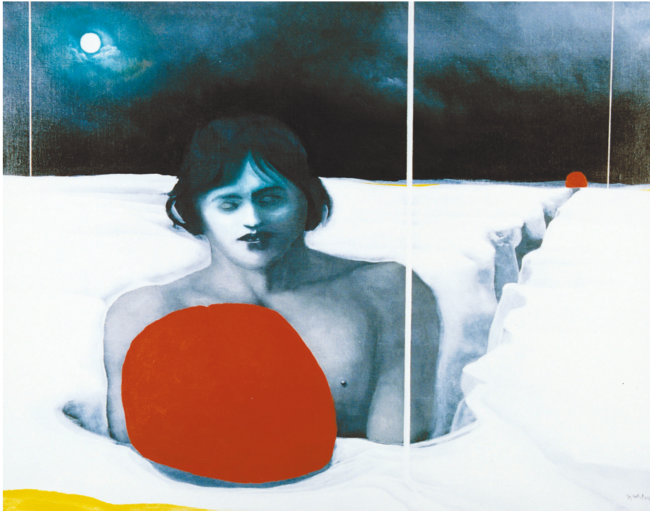
Bjarne Holst: Endymion, 1984, acrylic painting, 80 x 100 cm, Nordkappmuseet, Honningsvåg, Norway

of human emotions that ploughed their way into the imagining of northern Norway with Holst's remarkable achievement. Furthermore, the painting charts the icy climate for homosexuality and same-sex marriages at the time. 17 As the title suggests, the image also portrays the determinate love for any man of snow – the image implies obsession, fetish, and fixation. In all these respects, the haunting anthropomorphizing power of the painting imagines the many other communities in northern Norway, the soulscapes of all individuals who were not emotionally and legally included in the prevailing fabric of their immediate location, or their nation's. As such, Holst's visual art imagines the singular identities and belongings within community, a focus on the individual that Anderson's theories lacks, and Espolin Johnson's art often ignores.