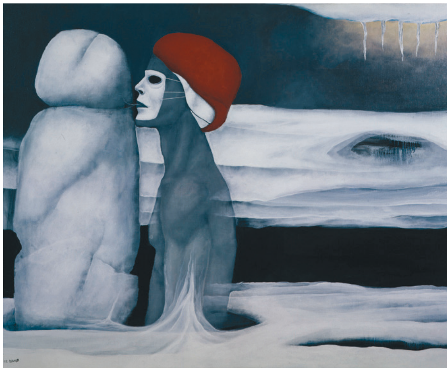
Bjarne Holst, Kjærlighet til en snemann (Love for a Snowman), 1988, acrylic painting, 60 x 80 cm, Private, Nordnorsk Kunstmuseum

duality of physical desire and spiritual interests, the gender battle of woman and man, the power struggle between wife and husband, the oppositions of nature and culture. A superimposition upon the couple's situation – husband and wife? – of the arctic nature creates an emotional topography beyond the physical and corporeal.