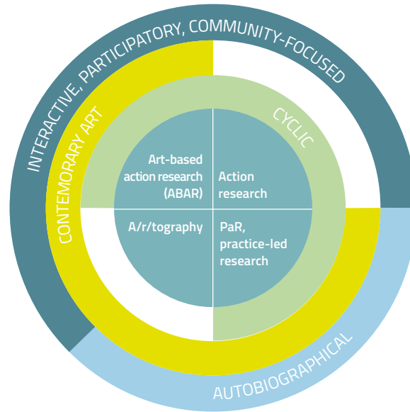
Figure 2. ABAR (art-based action research), action research, a/r/tography, and practice-led artistic research emphasise the researcher’s autobiographism, interaction cyclicality, and contemporary art phenomena in different ways (Huhmarniemi, 2016, p. 44).

common factor between art-based action research and a/r/tography is that practice and theoretical research run in parallel, and the research topics are situated in the middle ground of teaching, art, and communities. While phenomenology, feminist theory, and theories of contemporary art have contributed to a/r/tography (Irwin & Springgay, 2008; Springgay, Irwin, & Kind, 2008), art-based action research adheres to the working methods of environmental and communal art, project-based action, and community-based art education. Thus, inclusion, interaction, and a sense of community are emphasised in art-based action research. The autobiographism of the researcher is usually emphasised more in a/r/tography than in art-based action research (Figure 2).