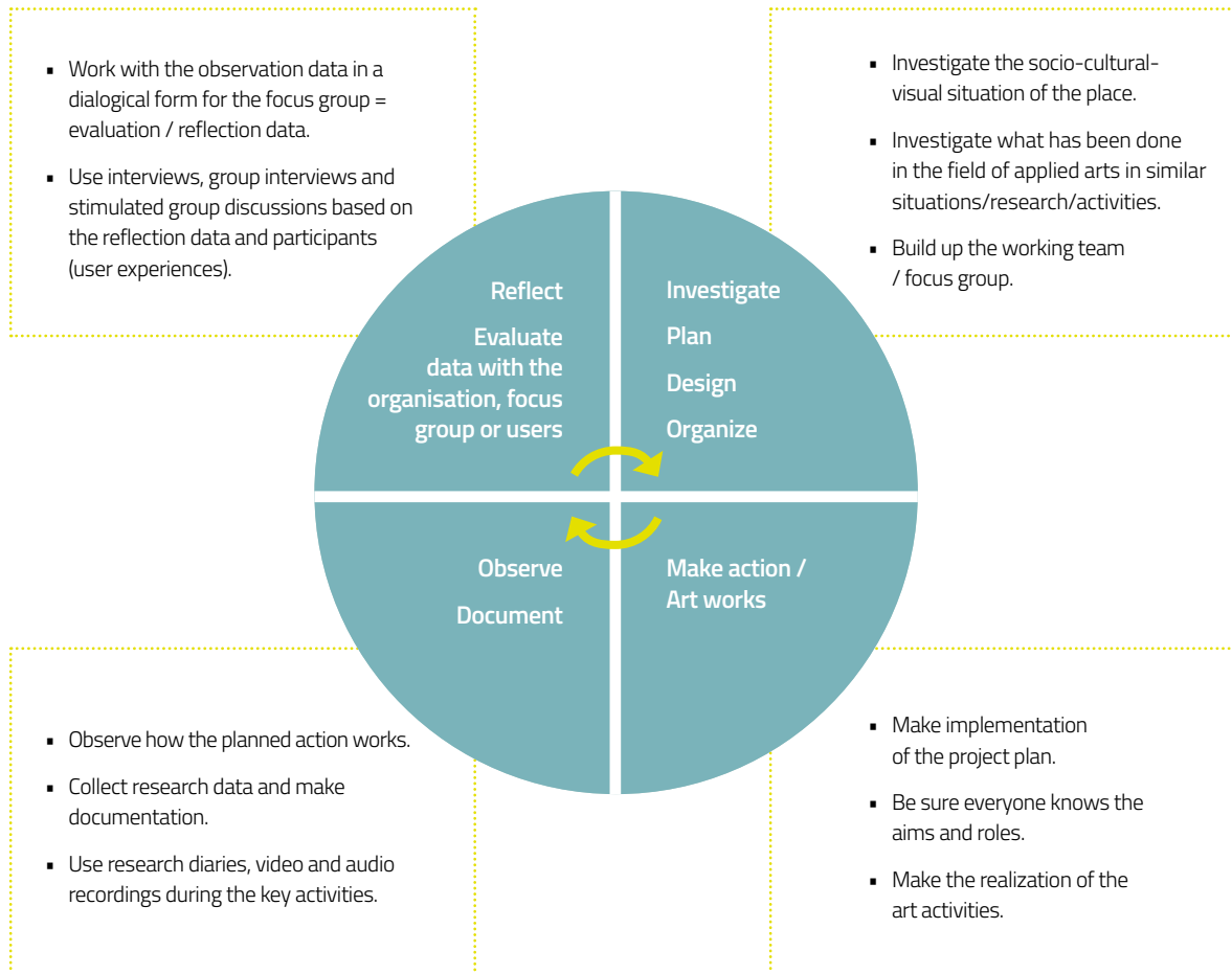
Figure 3. Art-Based Action Research cycles described by Timo Jokela.

Each cycle of art-based action research begins with planning, setting goals, and investigation of socio-cultural situations in the community or place. The next step of making action and art works can be defined as an intervention. Activities are observed and documented as the research material. Each cycle closes with reflection on and analysis of the research data (Figure 3).