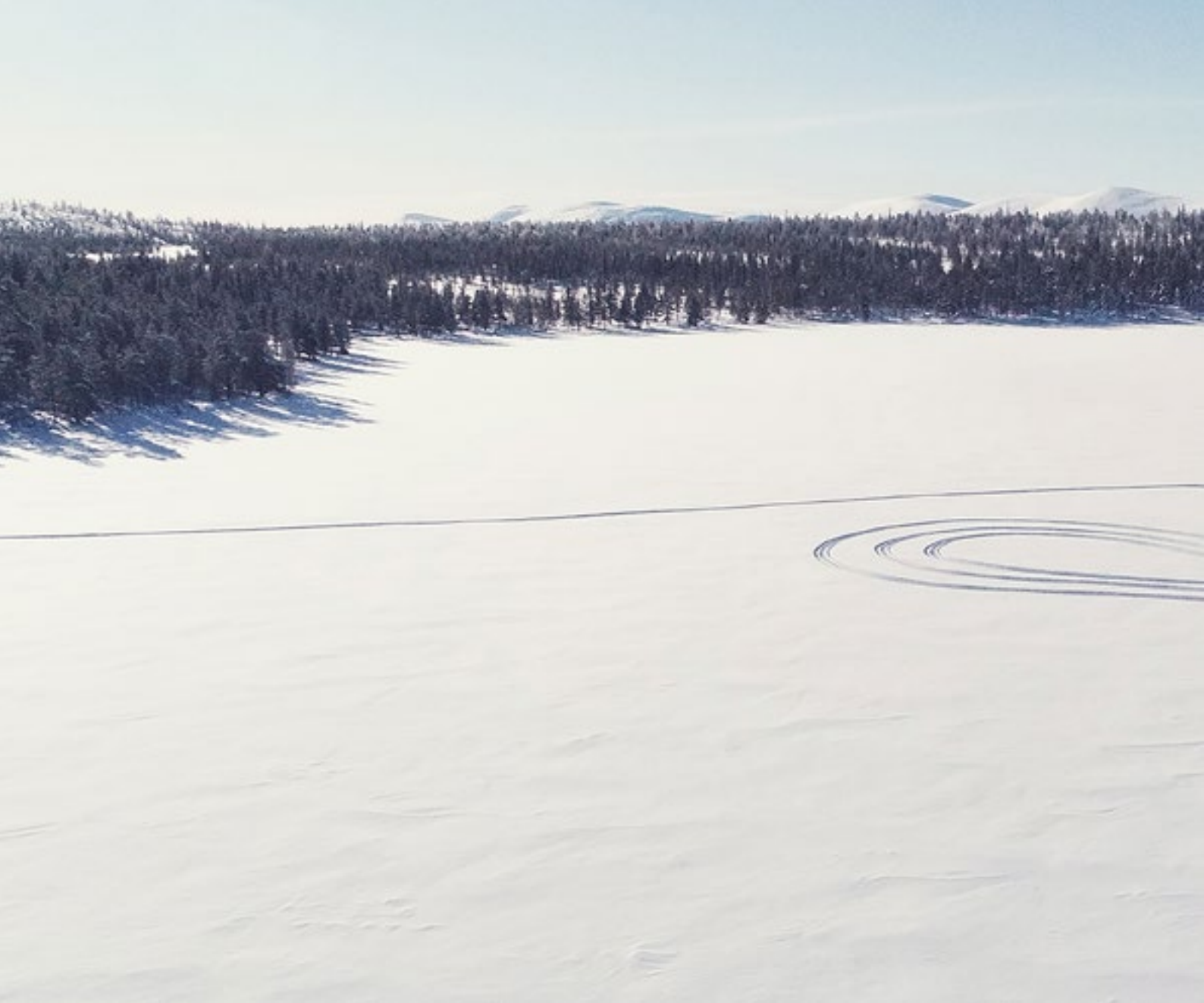
Juho Hiilivirta, Snow Butterfly , 2018, documentary photo from community art.