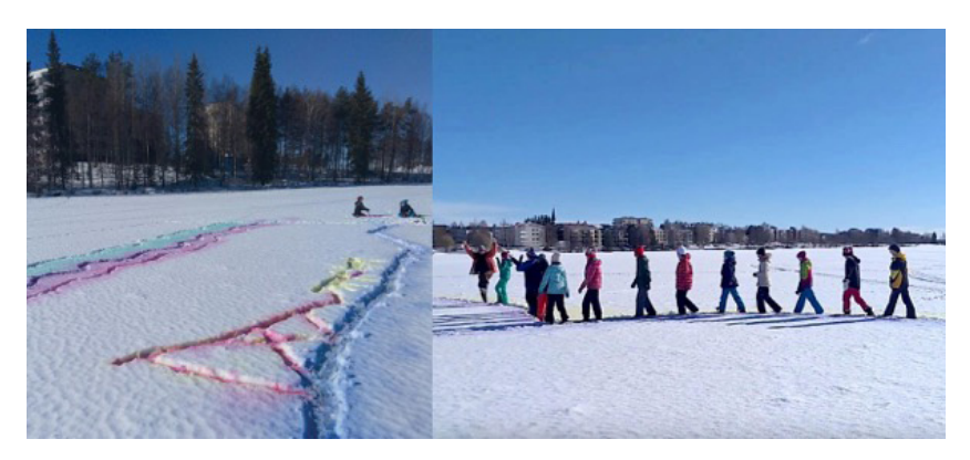
Image 6. Finally, the massive Arctic snow drawings were examined with the whole group, with some dancing on the way.

The workshop in Norway followed the theme of marine debris in the area, and participants worked together on the shore, collecting marine litter and creating a temporary sculpture called the Sea Monster .