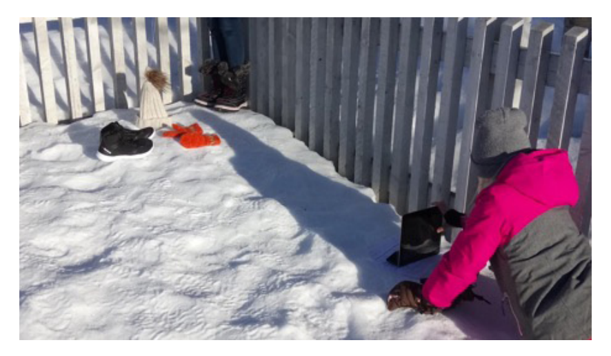
Image 5. Shoes having a meeting with a woolly hat and mittens.

The pupils were really proud of the animations and wanted to watch them twice in the end. They commented on each other's animations and the atmosphere was excited. (Student report)