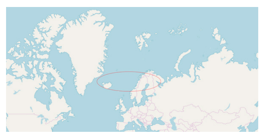
Map 1. Nordic Arctic marked by the red circle by the author.

A place is a layered location with human histories and memories (Lippard, 1997). Our perceptions of places are influenced by the people and culture connected to the place. We change along with the changing places, and places change both through people's actions and on their own (Hyry-Beihammer, Estola, & Hiltunen, 2014; Massey, 2005). Similarly, the narratives and cultures of the place change over time (Massey, 2005). They are strongly connected to politics and power, which brings up questions about agency and participation (Fairclough, 2009; Hiltunen, 2009; Jokela & Hiltunen, 2014).