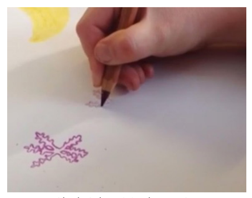
Image 3 . In one of the schools, the pupils drew their Arctic elements as a starting point to collect the joint narrative of the place. A clip from the students' video.