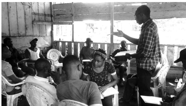
Figure 2. Discussions with locals. Authors' field data gathered in 2017.