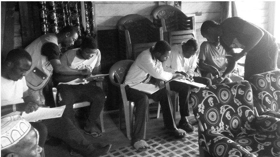
Figure 3: Conducting interviews at Munyange. The authors' field data gathered in 2017.

According to Doody et al. (2012), focus groups help researchers disclose knowledge uncovered by other methods of data collection. Consistent with this view, we reviewed unpublished data obtained from the MCNP office in Buea, targeting assessment and monitoring reports written between 2009 and 2016 by park officials, for the 41 villages around MCNP. Using this data, we were able to determine villages associated with the use of forests. To identify villages in contact with the park, we adopted Maxwell and Miller's (2008, p. 462) principle of