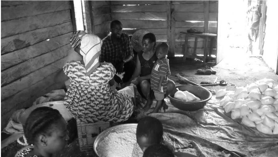
Figure 2: Meeting with farmers at Boviongo. The authors' field data gathered in 2017.