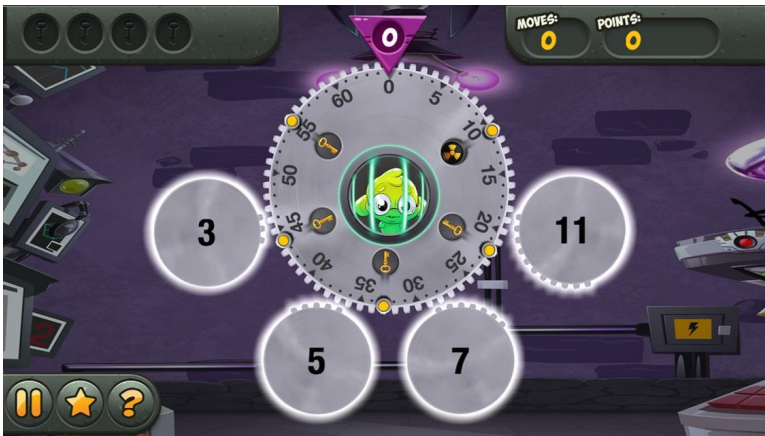
Figure 2. Wuzzit Trouble game interface (level 3)

In the game, the player turns one or more small cogs to move the large gear and reach the keys. For example, one key is located at number 22 on the large gear, and four small cogs are at 3, 5, 7 and 11 in Figure 2. The player can tap and turn cog 11 two times to reach the key, free the Wuzzit and get the bonus item, which is located at number 11.