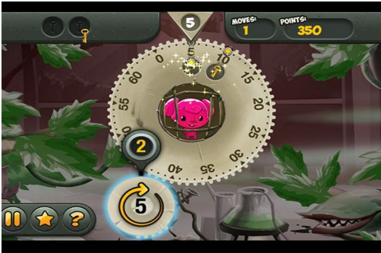
Figure 1. Wuzzit Trouble game interface (level 1)