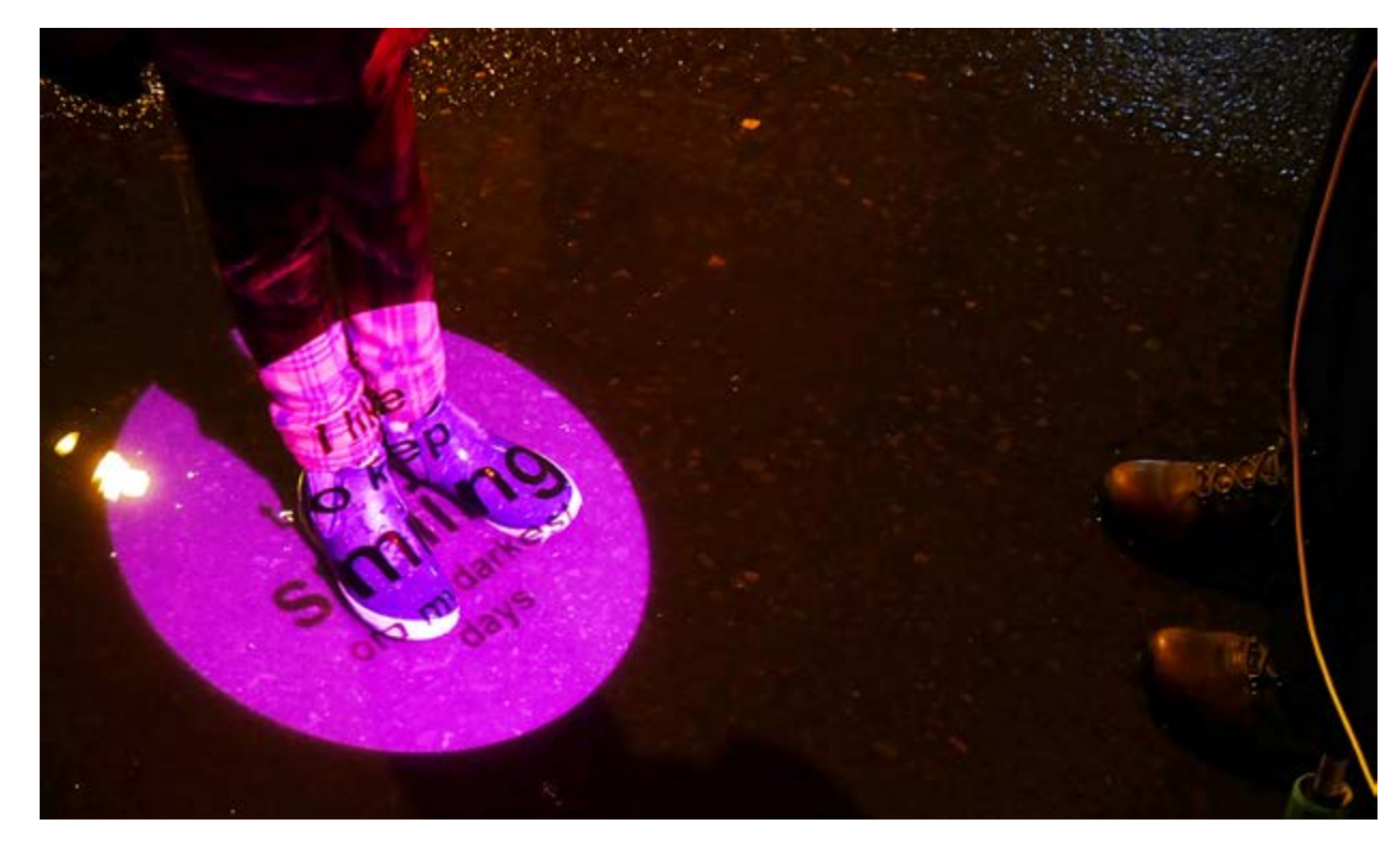
Figure 5. Swap Shots Mobile Film Exchange. Walkabout #2, experimental projection of an excerpt from writing by a member of the #SHET-LANDCREW in writing workshop with Jen Hadfield. Lerwick, Shetland. 2020.

Carden, S., Permar, R., & Wild, S., (Eds.) (2022). Home and Belonging. Exhibition catalogue. [Available online: https://pureadmin. uhi.ac.uk/ws/portalfiles/portal/30785853/Home_and_Belong-ing_Catalogue.pdf]