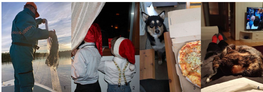
Figure 4. The Sámi reindeer herders' daily lives are also similar with the majority population. From the left: Author's own photograph 1, 2023, photograph 2, 2012 by K. Ukkonen, photograph 3, 2021 by S. Kustula and photograph 4, 2016 by Sara family.

A sample of photographs from the book in Figure 3 show that the families wanted to bring forward positive features of themselves as skilled, professional, and hardworking outdoor people who are proud of their Sámi Indigenous heritage and especially proud of being reindeer herders. They also added photographs in the book that pointed out commonalities with the majority people. The photographs in Figure 4 disseminate their everyday lives also as familiar and approachable. The usual outcome of the Photovoice method, that has been used in Social Sciences and the realm of social work, has revealed misery or a minority population's struggles (Wang & Burris, 1997). The reindeer herders' photographs had on the contrary a positive daily character. Exploring the daily chores by photographing was clearly empowering. The photographs reveal and confirm the families' Cultural Knowledge so that the viewer may adapt, understand, and learn. The Boazoeallin exhibition and book describe the reindeer herders' daily life and noteworthy stories. The book contained explanations that widened the understanding of the photographs. These explanations are based on the stories and discussions of the research community. The exhibition and book are both considered as a visual-art-based result of the research.