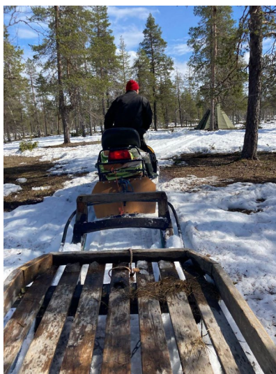
Figure 2: The reindeer herders' Cultural Knowledge is visible in the pictures. A written explanation might increase the information for those who are not familiar with the culture.