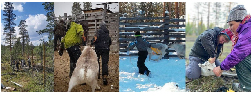
Figure 3. The Sámi reindeer herders are hardworking outdoor people. From the left: Photographs 1-2, 2021 by S. Kustula, photograph 3, 2017 by K. Ukkonen and photograph 4, 2022 by E-M. Hetta.

In this research, we used the Photovoice method (Wang & Burris, 1997) to gather information about the reindeer herders' daily life. This method suited the study purpose well by empowering the community and building self-esteem and trust in our research. Further, it produced visual data and revealed Sámi reindeer herders' cultural knowing (Wang, 2011). The photographs and texts in the Boazoeallin book tell a story about happy people living a good life.